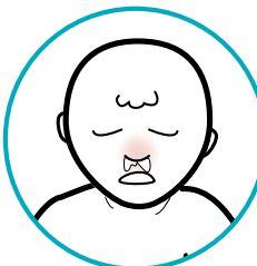
After the nasal spray influenza (flu) vaccine: nasal congestion and runny nose