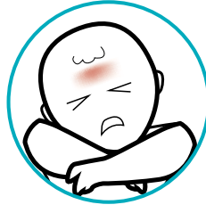
Tiredness and headache