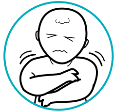
Fever and chills