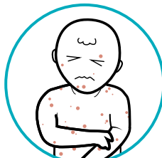
After MMR and varicella vaccines: fever, rash, and other side effects may occur about 1-2 weeks after immunization