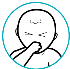
Nausea, vomiting, and diarrhea