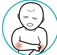
Muscle and joint soreness