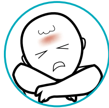
Tiredness and headache