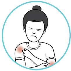
Muscle and joint soreness