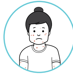
After MMR and varicella vaccines: fever, rash, and other side effects may occur about 1-2 weeks after immunization