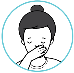
Nausea, vomiting, and diarrhea