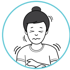
Fever, chills, and shivering