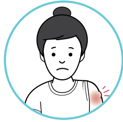
Pain, redness, and swelling where the vaccine was given

For COVID-19 vaccines: can occur up to 7 days after