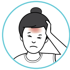
Tiredness and headache