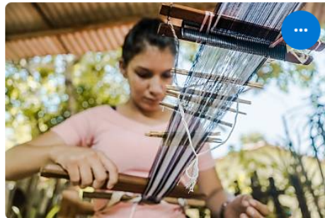
Artisan weaving the guard (II) Read more on the element

An information and exchange session will be held at UNESCO Headquarters, Paris, on 1 October 2024 (afternoon) to present the working methods of the Committee as well as practical information concerning this session. This information and exchange session will also be broadcast live on the 19.COM webpage.