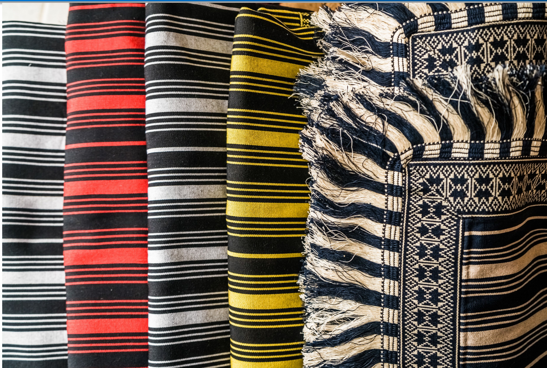
Ancestral and traditional techniques for the elaboration of the 'Poncho Para'i de 60 Listas', from the city of Piribebuy, Republic of Paraguay