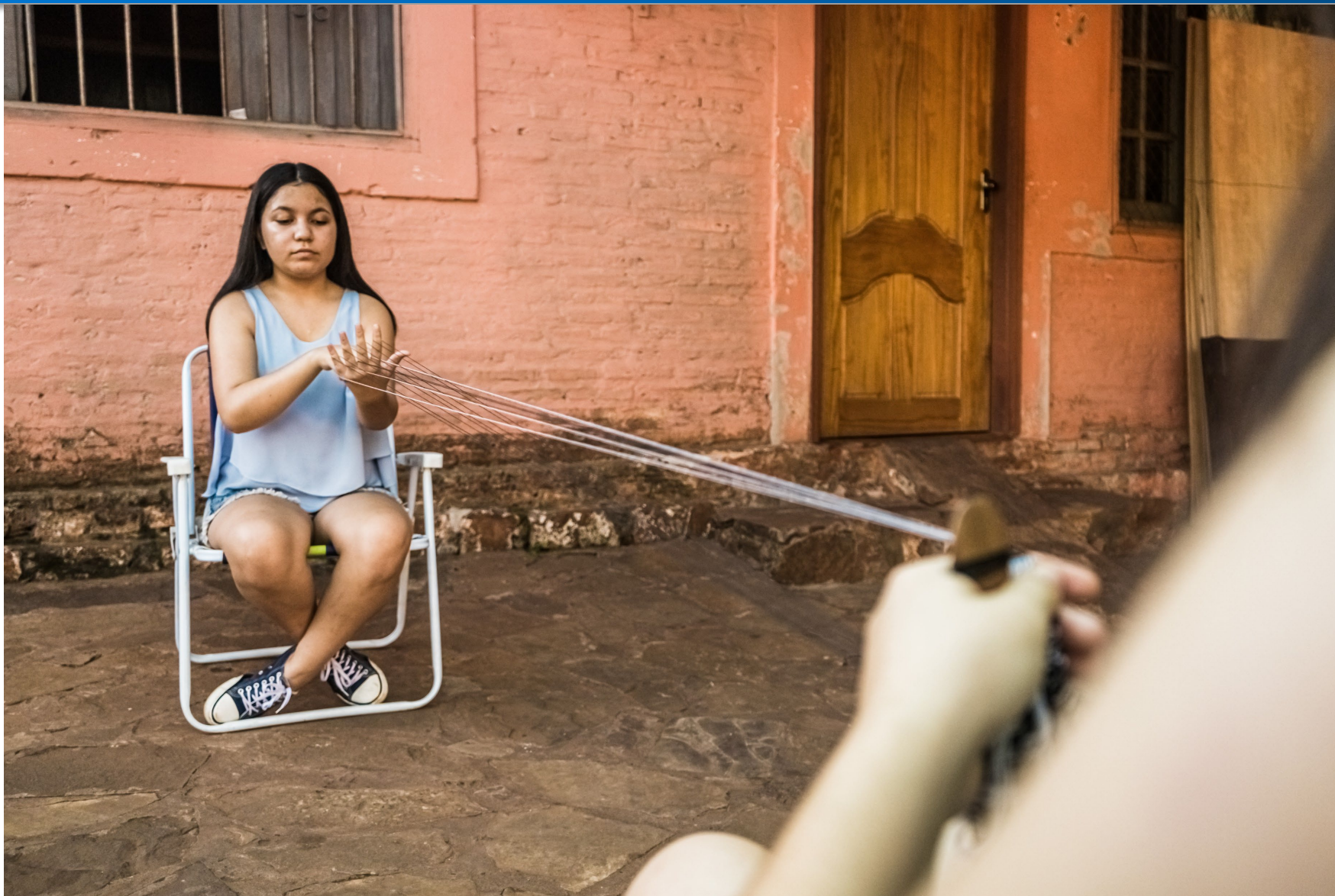
Ancestral and traditional techniques for the elaboration of the 'Poncho Para'i de 60 Listas', from the city of Piribebuy, Republic of Paraguay