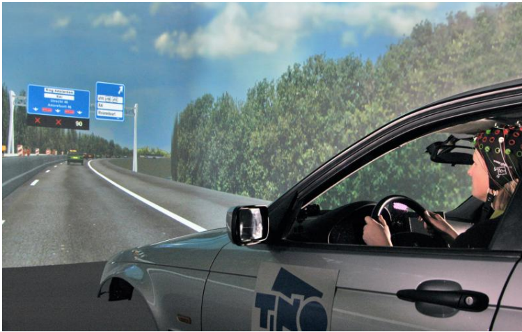
Fig. 3. Brain signals can be used to monitor for instance driver workload or to evaluate in-vehicle systems that may interfere with the primary driving task.