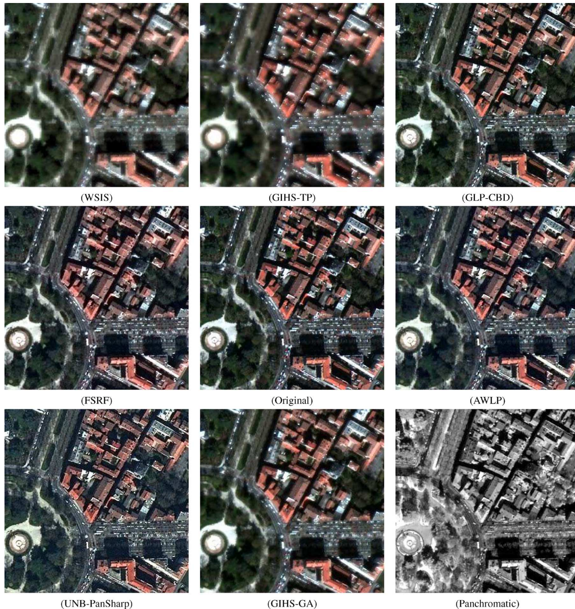
Fig. 1. Results of the fusion algorithms displayed as 352 \times 352 true color compositions at 0.8-m pixel spacing for the simulated Pléiades image of Toulouse, urban ROI. The reference 0.8-m original MS bands and the Pan image are also displayed.

(blue, red). Errors in colors lead to interpretation errors. Contours should be sharper. There is no bias, except for Strasbourg outskirts. Unacceptable for detailed visual analysis.