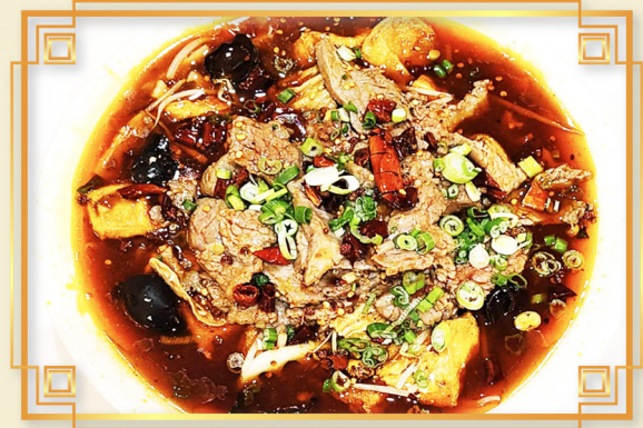
30 水煮牛肉 Sliced Beef in Spicy Sauce