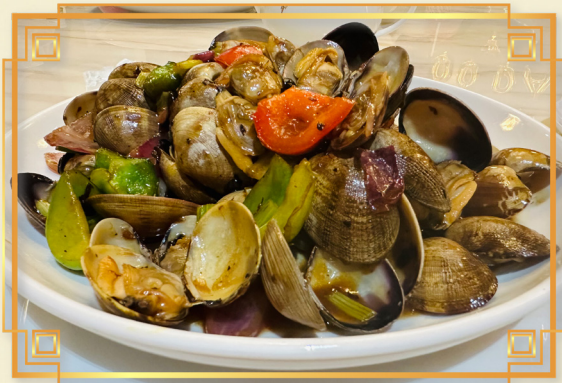
68 豉汁花蜆 Stir-Fried Clams w. Black Bean Sauce