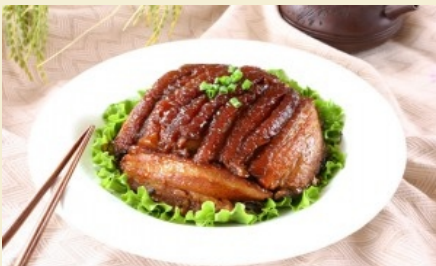
客家梅菜扣肉 Hakka Braised Pork Belly w. Preserved Vegetable