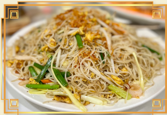
104 客家炒米粉 Hakka Mei Fun