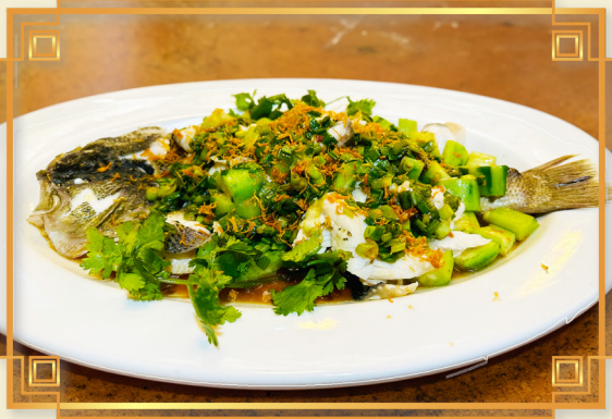
88 蔥撈盲槽 Fresh Fish w. Scallion