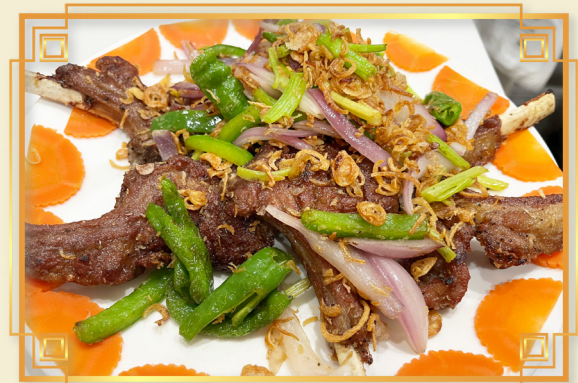
38 客棧香蔥羊架 Lamb Chops w. Onion