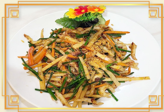
54 龍鬚銀魚小炒皇 Stir Fried Silver Fish, Squid w. Jicama & Chives