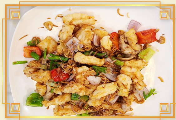
65 椒鹽鮮魷 Salt & Pepper Deep Fried Squid