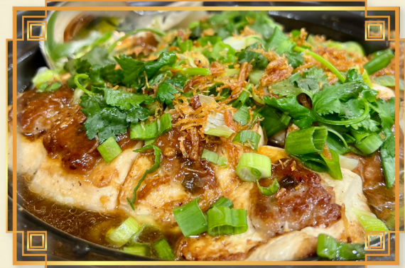
49 客家釀豆腐 Hakka Stuffed Tofu