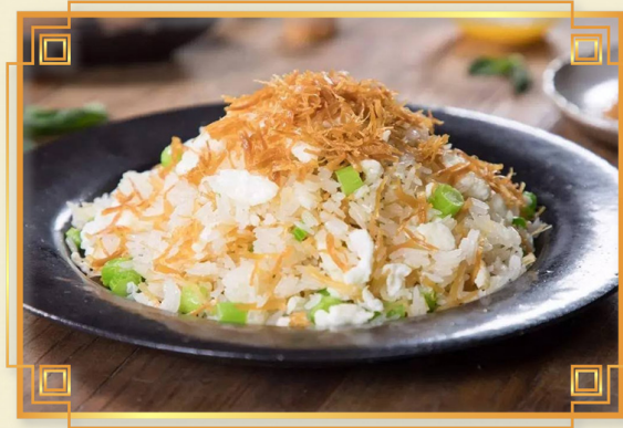
107 瑤柱蛋白炒飯 Dried Scallops & Egg White Fried Rice