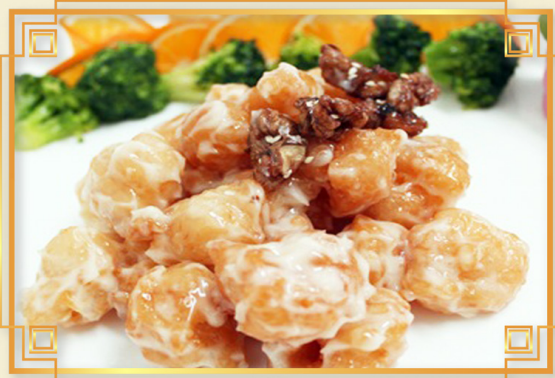
67 琥珀沙汁蝦球 Honey Walnut Prawns