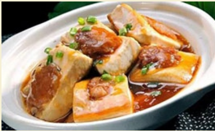
客家豆腐 Hakka Stuffed Tofu

The Hakka people are nomadic tribes who originated in China, and have now spread throughout Asia. Hakka food may appear simple, but is delightfully tasty at its core. The hallmark of Hakka cooking focuses on the texture of the food, featuring meats that are meticulously stewed, braised, or roasted. These dishes are often accompanied by vegetables whose flavors are enhanced by pickling/preserving. Sample an assortment of well-known Hakka dishes on our menu, including Hakka Stuffed Tofu, Salt Water Chicken, Braised Pork Belly with Preserved Vegetables, and Poon Choi.