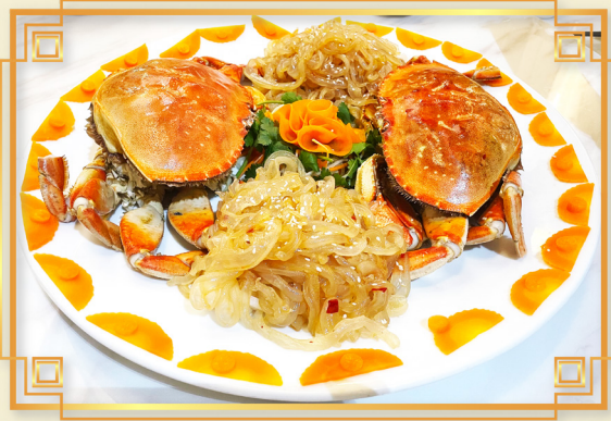
83 凍蟹配海蜇絲 Cold Dungeness Crab w. Jellyfish