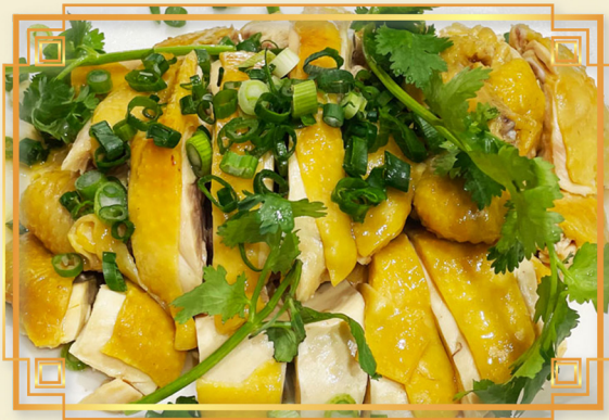
23 客家鹽水雞 Hakka Salt Water Chicken