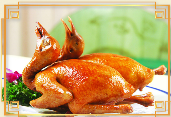
48 紅燒乳鴿 Crispy Squab