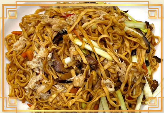
102 蟹肉幹燒伊麵 Braised Crab Meat w. E-Fu Noodles