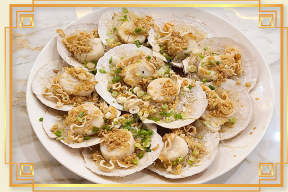
90 蒜蓉粉絲蒸帶子 Steamed Scallop w. Garlic & Vermicelli