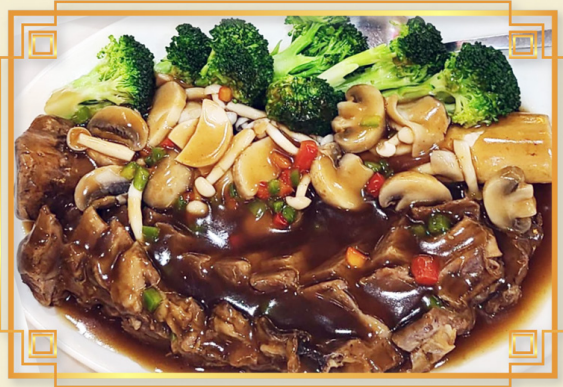
31 紅酒牛肋骨 Briased Beef Rib in Red Wine