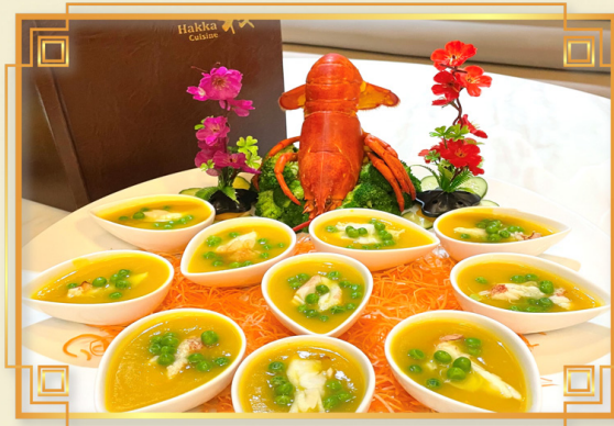
77 金湯龍蝦 Lobster in Pumpkin Soup