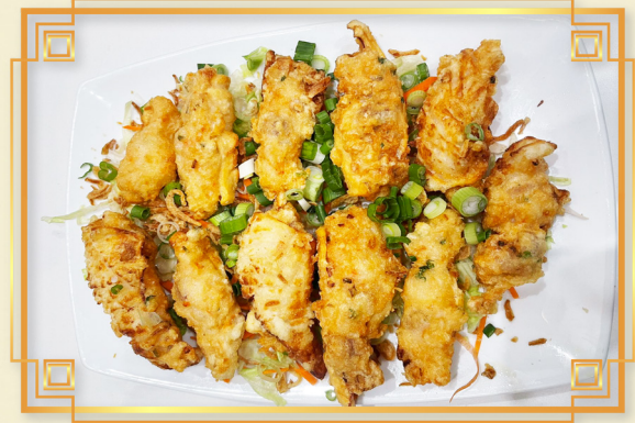
56 百花釀吊片 Hakka Stuffed Dried Squid w. Shrimp