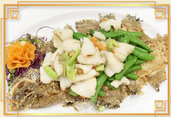
43 骨香生炒龍利球 Sautéed Grey Sole Fish Fillet