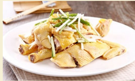
客家鹽水雞 Hakka Salt Water Chicken