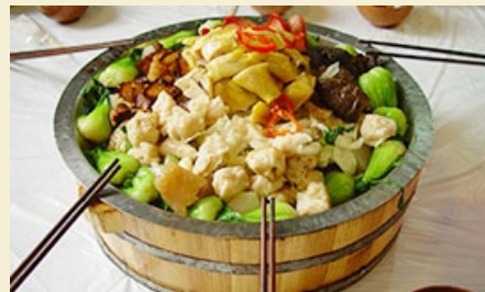
客家盆菜 Hakka Poon Choi