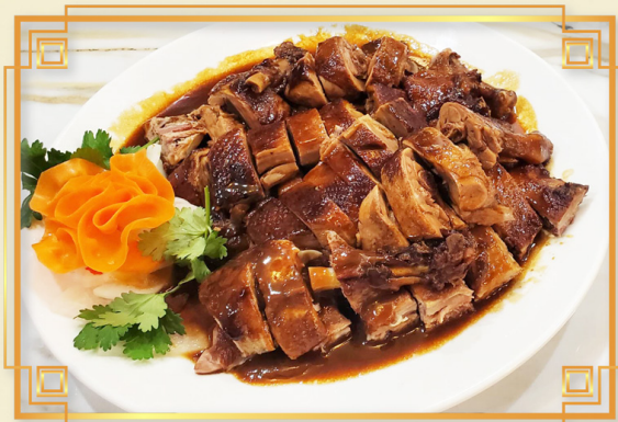
28 客家碌鴨 Hakka Braised Duck