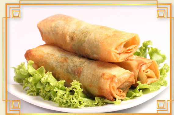
08 素春卷 Vegetable Spring Rolls