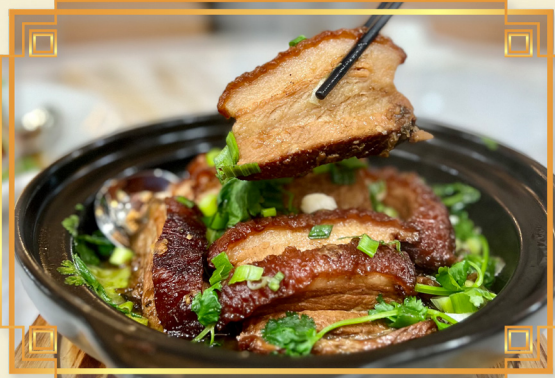
46 客家梅菜扣肉 Hakka Braised Pork Belly w. Preserved Vegetables