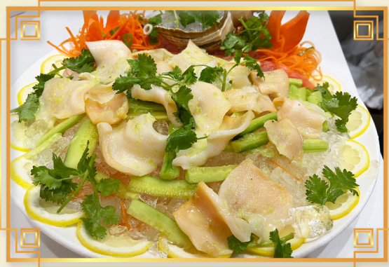
61 冰鎮鮮活螺片 Chilled Sliced Conch