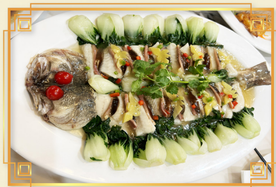
93 翡翠麒麟魚 Steamed Fresh Fish w. Dried Mushroom & Ham