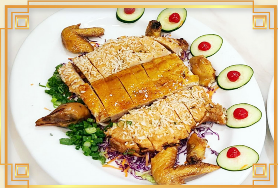
25 芋香百花雞 Hakka Blossom Chicken (Whole)