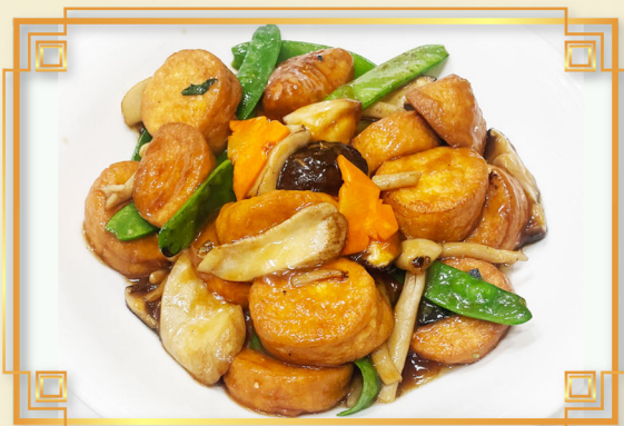
119 鮮菌扒玉子豆腐 Assorted Fresh Mushrooms w. Egg Tofu