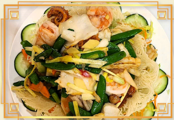
70 雀巢海中寶 Seafood Delight