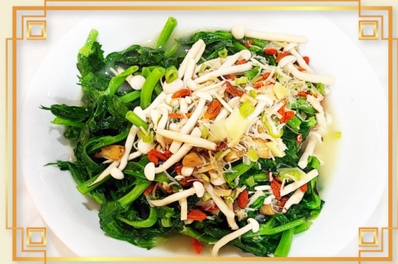
111 上湯蝦乾浸豆苗 Sautéed Pea Shoots w. Dried Shrimp