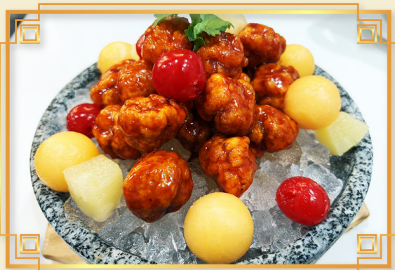
74 冰鎮咕嚕肉 Chilled Sweet & Sour Pork