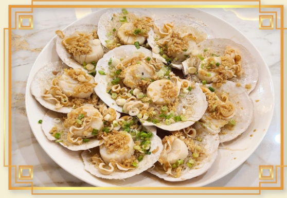
蒜蓉粉絲蒸帶子 Scallop Steamed w. Garlic & Vermicelli