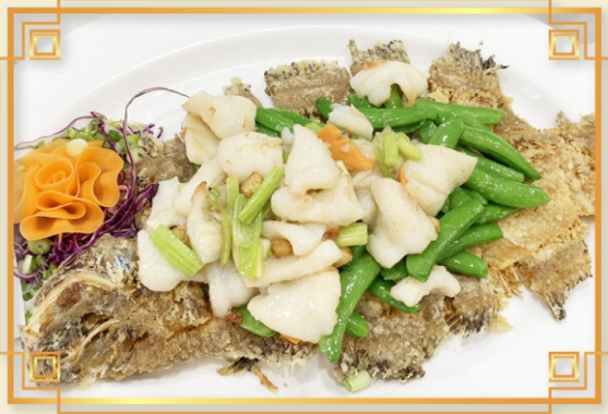
骨香生炒龍利球 Pan-Fried Whole Grey Sole Fish