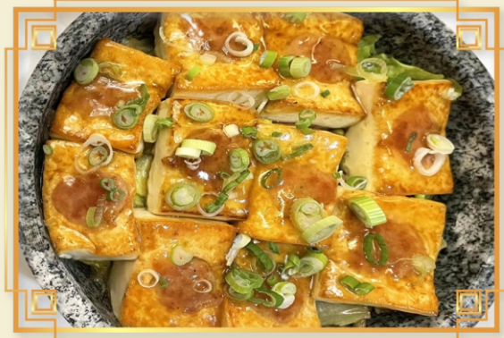
客家釀豆腐 Hakka Stuffed Tofu