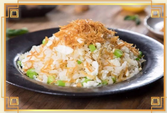
瑤柱蛋白炒飯 Dried Scallops & Egg White Fried Rice