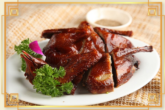
紅燒乳鴿 Crispy Squab