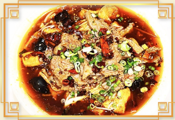
水煮牛肉 Sliced Beef in Sweet & Spicy Sauce