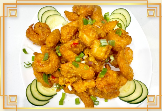
霸王蝦球 Prawns w. Salted Egg Yolk