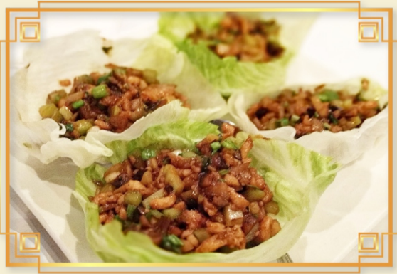
雞肉鬆生菜包 Stir Fry Chicken & Pine Nuts Wrapped w. Lettuce