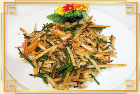
龍鬚銀魚小炒皇 Stir Fried Silver Fish, Jicama, Squid w. Chives