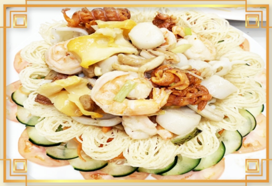
雀巢海中寶 Seafood Delight