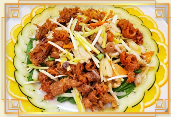
韭黃桂花蚌 Sautéed Osmanthus Clam w. Yellow Chives