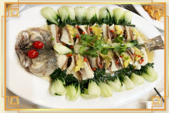
翡翠麒麟魚 Qilin Steamed Fish w. Dried Mushroom & Ham