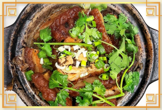
客家梅菜扣肉 Hakka Braised Pork Belly w. Preserved Vegetable