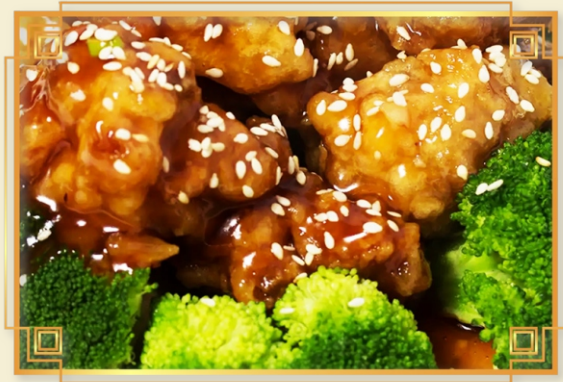
芝麻鸡 Sesame Chicken