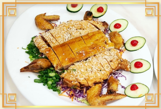
芋香百花雞 Hakka Blossom Chicken