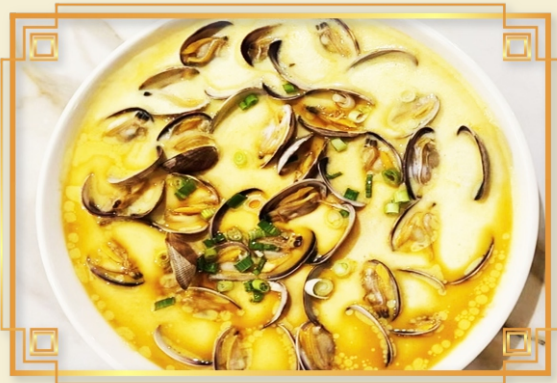
花蜆蒸水蛋 Manila Clams in Steamed Eggs