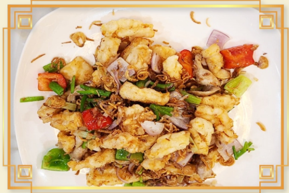
椒鹽鮮魷 Deep Fried Squid w. Salt & Pepper