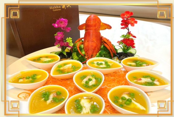
金湯龍蝦 Lobster in Pumpkin Soup