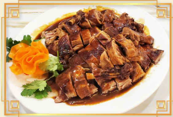
客家碌鴨 Hakka Braised Duck