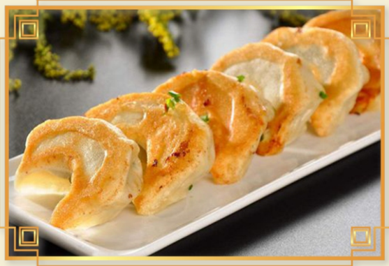
豬肉白菜煎餃 Pork & Chinese Cabbage Pan Fried Dumpling