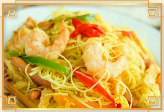
星洲炒米 Singapore Mei Fun