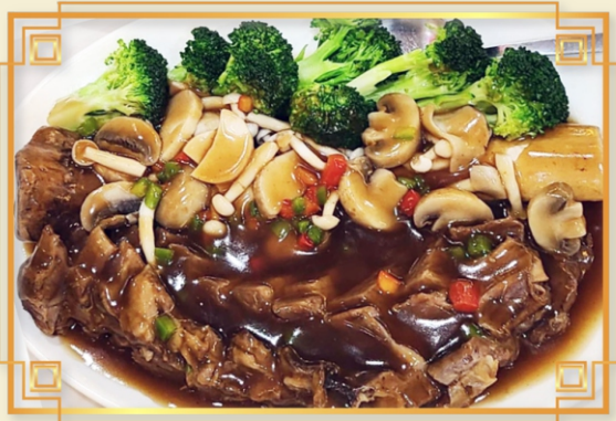
红酒牛勒骨 Braised Beef Rib w. Red Wine