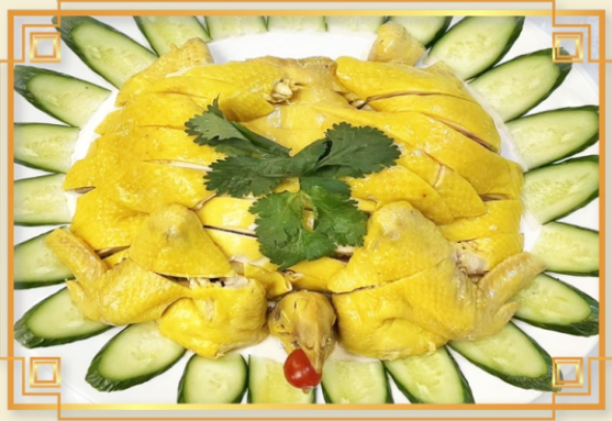
客家鹽水雞 Hakka Salt Water Chicken