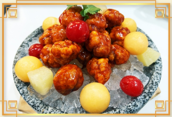
冰鎮咕嚕肉 Sweet & Sour Pork on Ice