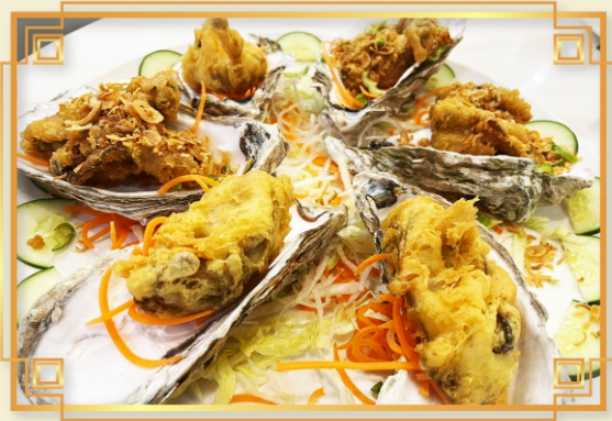
椒鹽生蠔 Deep Fried Oyster w. Salt & Pepper