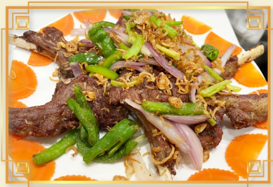
客棧香蔥羊架 Lamb Chops w. Onion