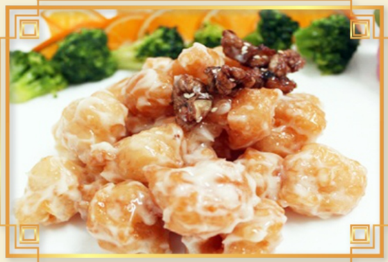
琥珀沙汁蝦球 Prawns w. Honey Walnut in Mayonnaise