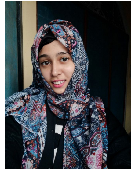
Outreachy intern, May 2021

* Percentages are based on the 2019 Outreachy longitudinal study. 219 out of 590 past interns responded. Past interns were asked what region of the world they were located in during their internship.