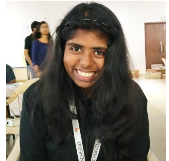
Outreachy intern, May 2020