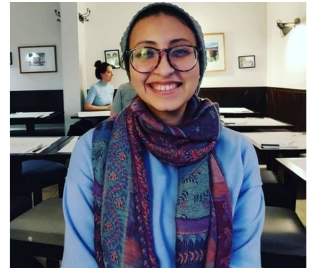
Outreachy intern, May 2020