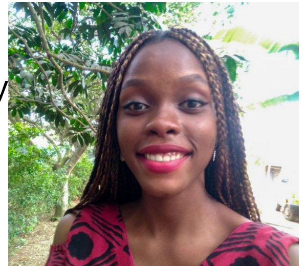
Outreachy intern, May 2021