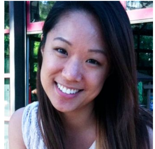
Outreachy intern, May 2020