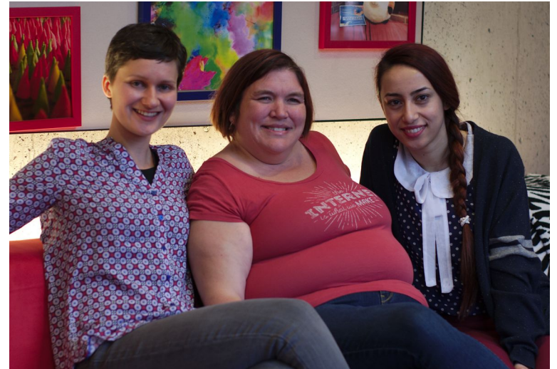
Outreachy interns and sponsor

*Sponsors can be invoiced sooner, if they need to meet quarterly deadlines. Invoices can also be sent as late as June 15.