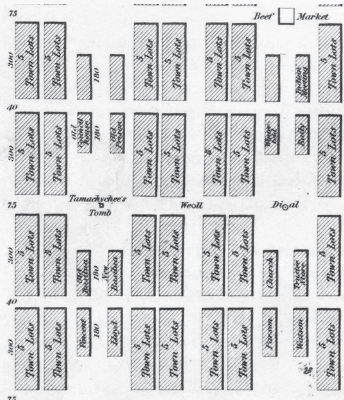
Detail of De Brahm's Plan of Savannah