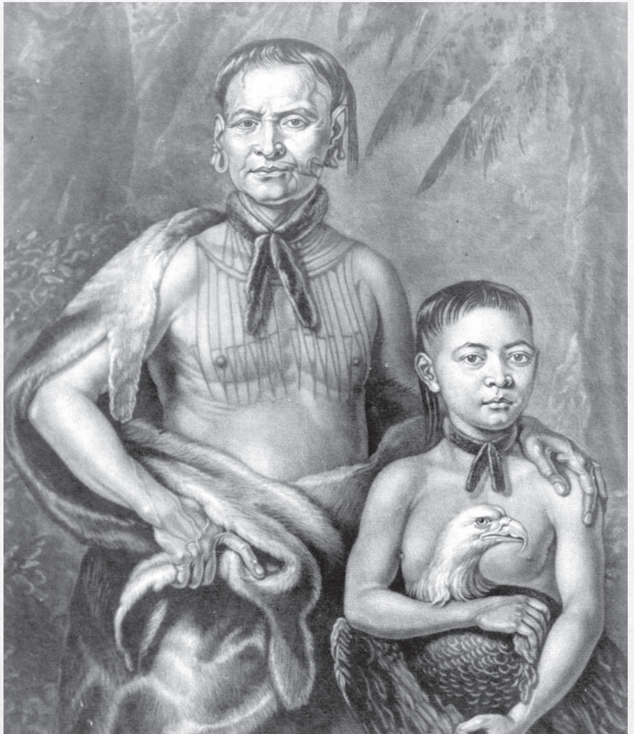
Tomochichi and Toahabwi, 1739

On February 12, 1733, General James Oglethorpe and the first 114 colonists from Great Britain landed on Yamacraw Bluff and founded the colony of Georgia. Given his previous experience with colonists (most likely from South Carolina), Tomochichi was not afraid of the new Georgia colonists but chose to use caution in his interactions with them. About a month after the colonists arrived, Tomochichi came to visit Oglethorpe in Savannah. Through the efforts of interpreter Mary Musgrove, he and Oglethorpe drafted a treaty allowing Oglethorpe to establish the City of Savannah and Tomochichi to benefit from trade with the colonists.