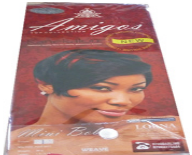
Plate 7: Mini Bob