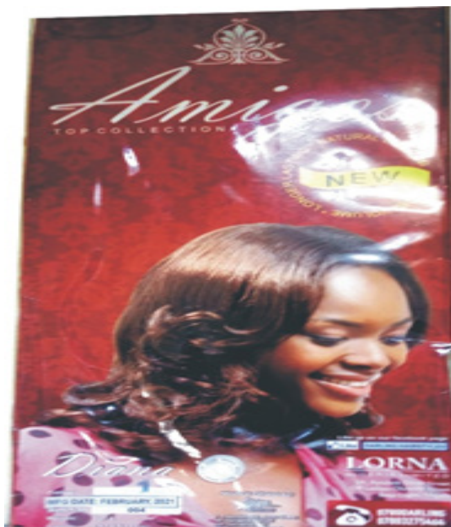
Plate 9: Diana