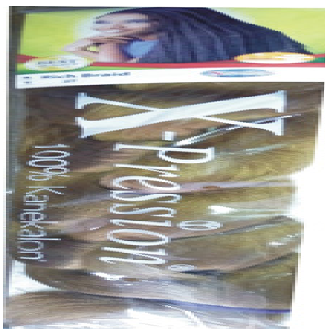
PLATE 10: X-PRESSION

the synthetic hair (wig) Gold used by hairdressers and their clients. Gold is a 64 cm long, golden, straight wig with more volume made in Indonesia by Donna Vonci Ltd. The style is designated classy deep and the colour 30/38; weight is 95g.