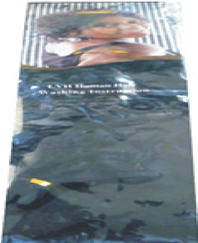
PLATE 5: LVH