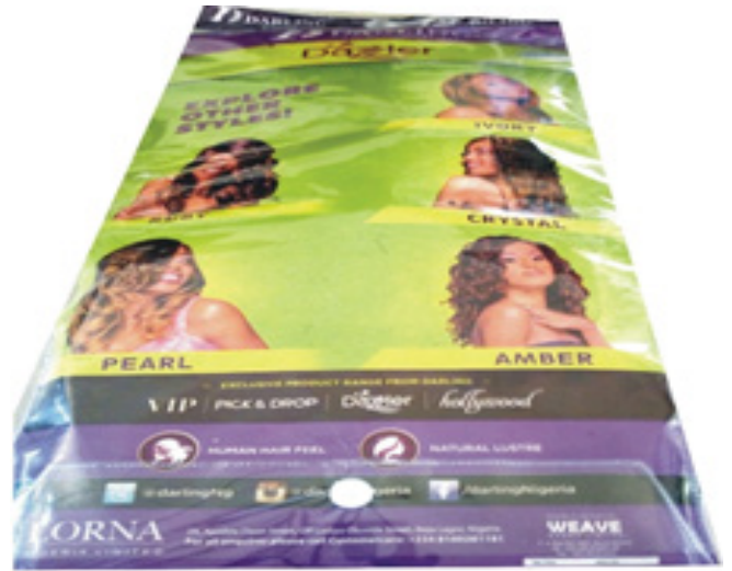
Plate 6: Dazzler