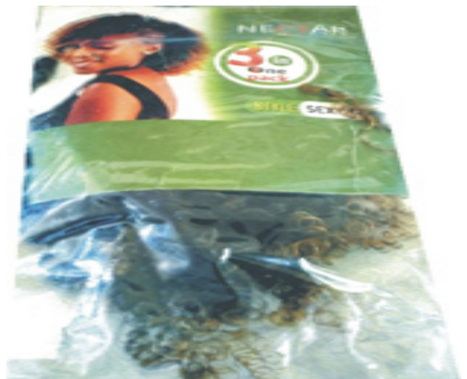
Plate 8: Nectar