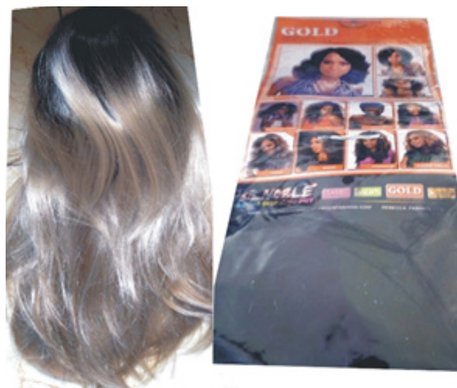
Plate 3A & 3B: Gold