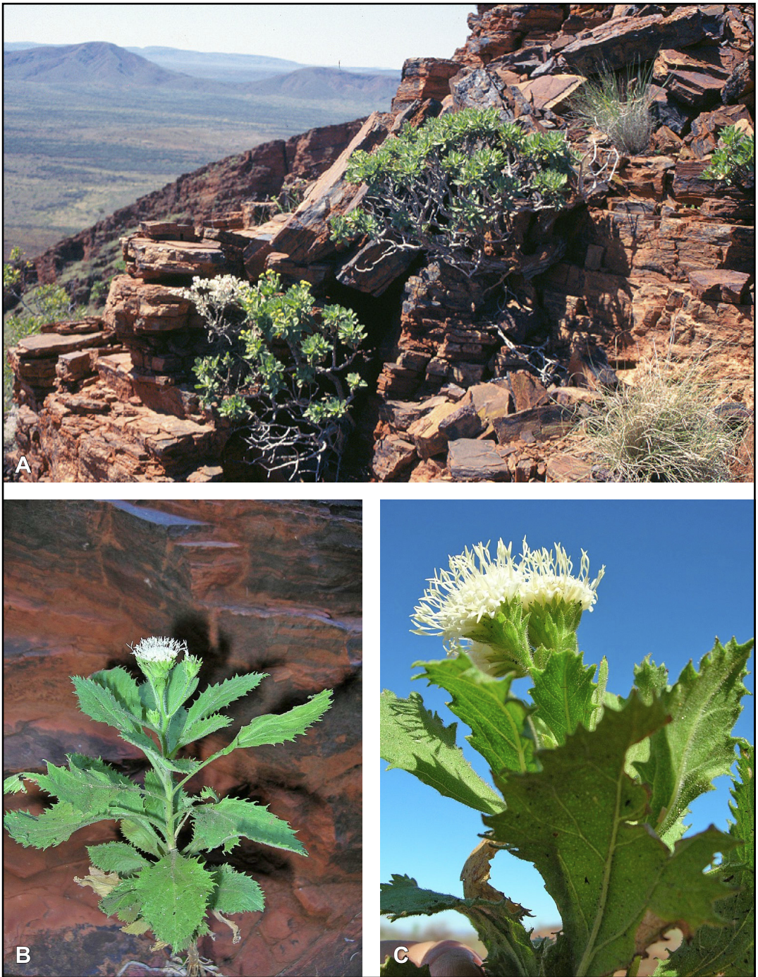
Figure 2. Pilbara trudgenii . A – habitat and mature habit; B – juvenile habit; C – flowering head.