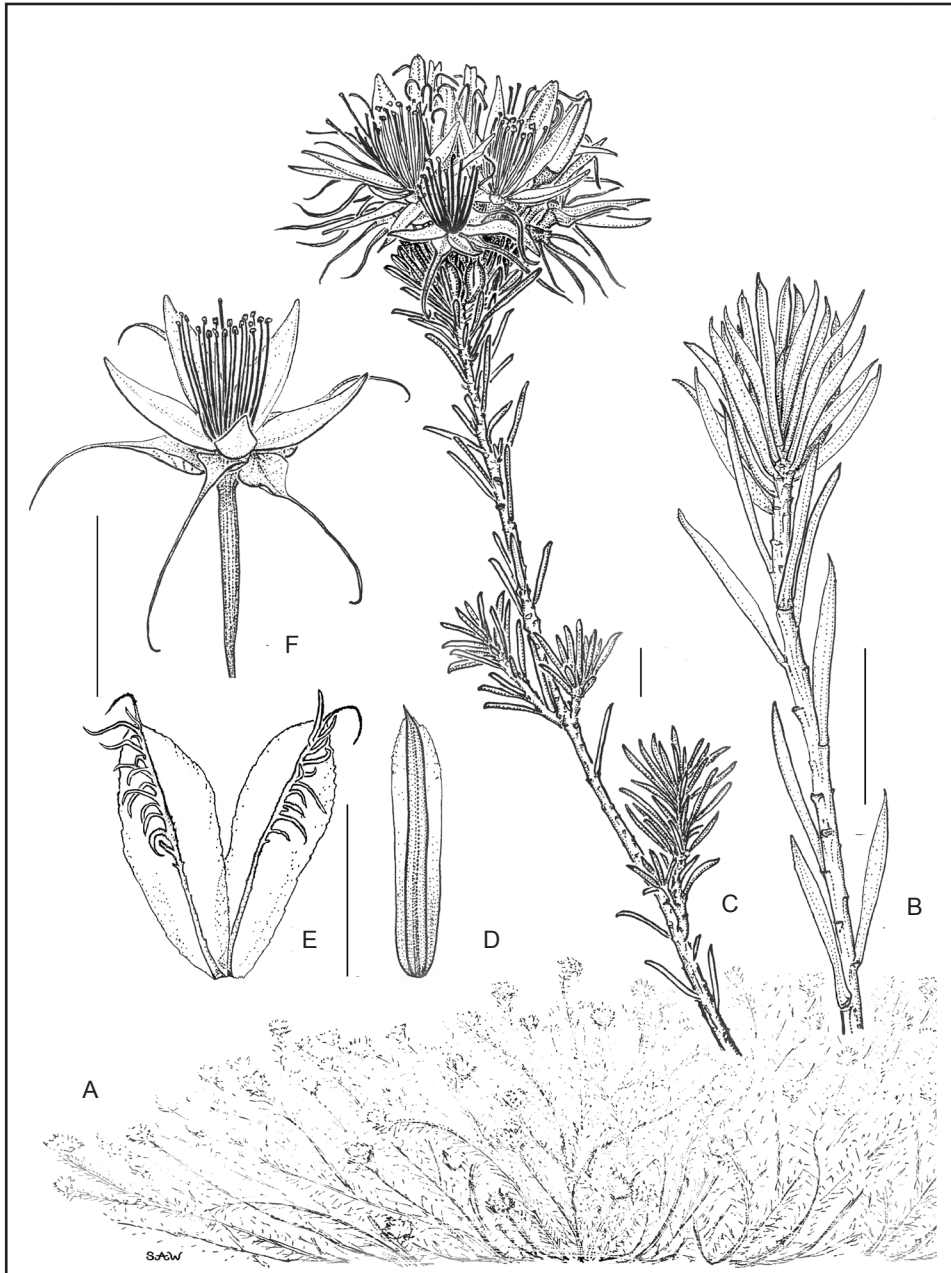
Figure 1. A–F. Calytrix gomphrenoides . A – habit; B – leafy stem; C – flowering stem; D – floral leaf; E – pair of bracteoles; F – flower. All from M.D. Barrett 433 (PERTH). Drawn by Sharyn Wragg. All scale bars = 1 cm.

after anthesis, abaxially suffused pink around reddish veins and with broad white margins, sometimes drying yellow. Stamens 16–18, 1-seriate; filaments white becoming pink then dark red, 3.5–9 mm long, of varying lengths in single flower; anthers all fertile, 0.25–0.40 mm long, the connective prominent, with 4 gibbous glands on abaxial face. Style persistent, exserted for 5–6.5 mm; stigma minute, narrower than style, minutely papillate. Mature seed c. 4 × 0.8 mm, very narrowly obovoid. (Figures 1, 2)