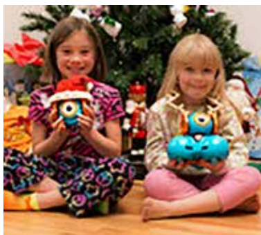
Figure 3. Dot and Dash programmable robots.