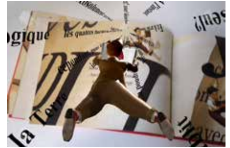
Figure 1. Fantastic Flying Books of Mr. Morris Lessmore (Source: Moonbot Studios).