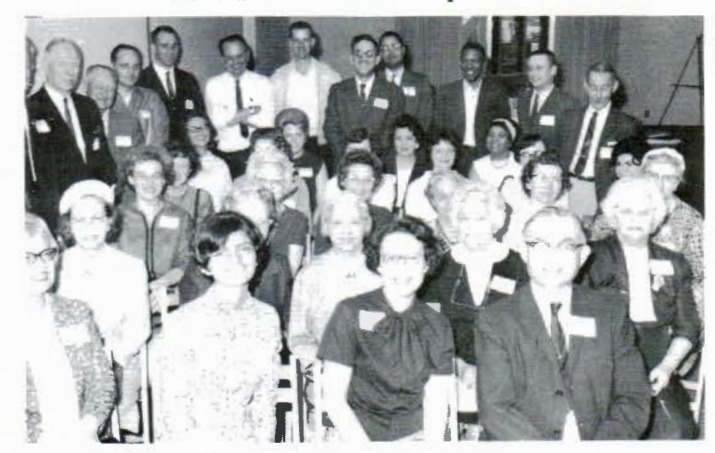
April 2 Institute in Springfield, Illinois.

from the Universal House of Justice to Bahá'í youth; youth projects and opportunities for active service; the responsibilities towards the National Fund; stories from the early days of the Faith showing the vital part which youth have played in its development — were among the subjects which the youth gave serious and thoughtful attention. There was a contest on "How I Can Help" with prizes for especially good ideas on: teaching, contributing, studying, praying.