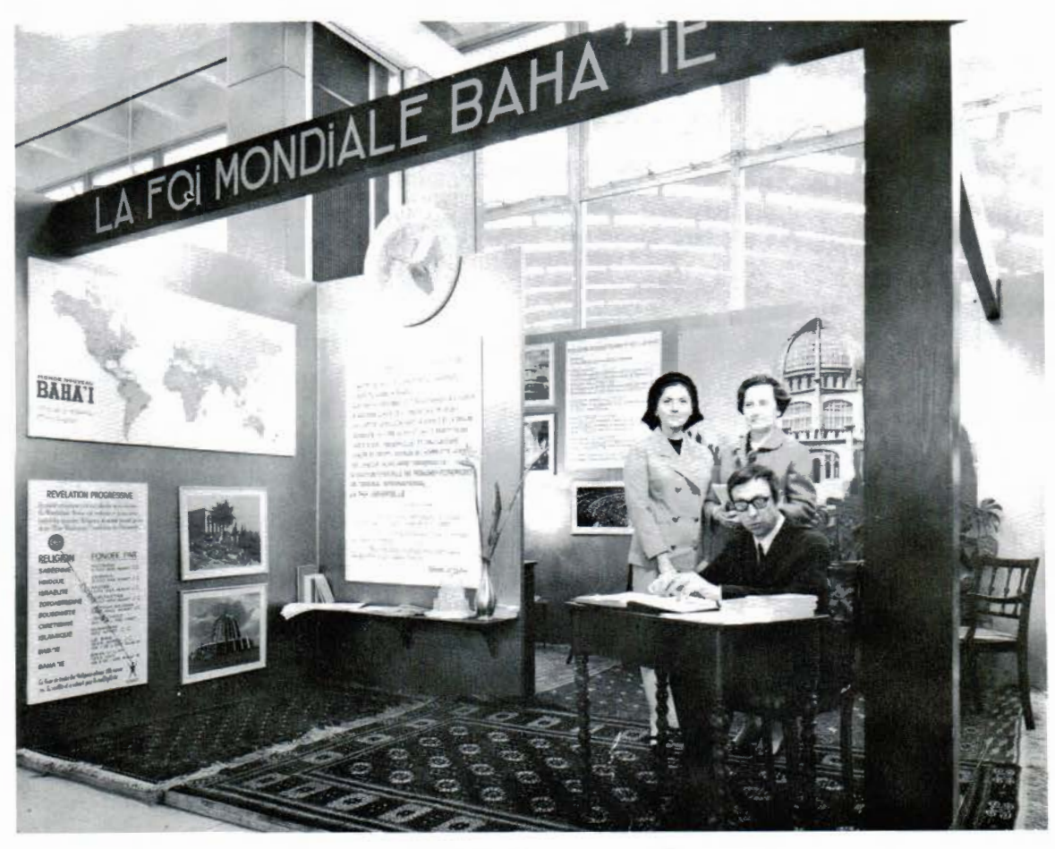
Bahá'í exhibit at Fair in Nice, France.

"Nous attachons le plus grand prix à la collaboration que vous voulez bien apporter à notre Comité et vous prions d'agréer, Cher Maître, l'expression de nos sentiments les plus distingués."