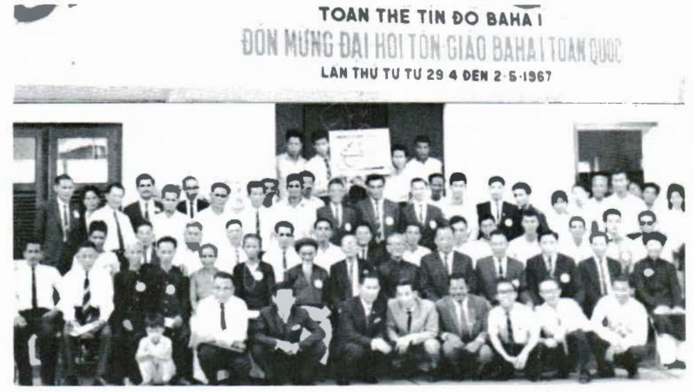
Delegates to the Fourth National Convention of the Bahá'ís of Vietnam, April, 1967.

It is understandable that the Universal House of Justice should cable the courageous friends of Vietnam: "DELIGHTED NEWS CONTINUOUS STEADY PROGRESS FAITH ASSURE BELIEVERS PRAYERS HOLY SHRINES BESEECHING BLESSINGS CONFIRMATION UNITED ENDEAVORS SERVICE CAUSE GOD LOVING RIDVAN GREETINGS."