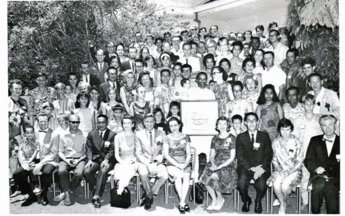
Fourth national convention of the Hawaiian Islands, taken on the front steps of the Ḥazi-rat'u'l-Quds.