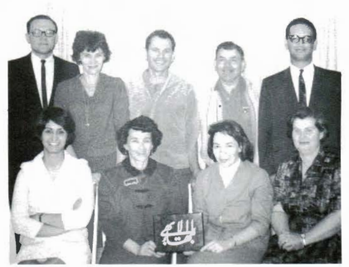
First local spiritual Assembly formed in Huntington Beach, California April 21, 1967.

The cheerfully decorated hall, with flowers and sparkling nine pointed stars contributed to the happy spirit of fellowship and joy which pervaded the evening—"even the kids" were thrilled with this potluck!