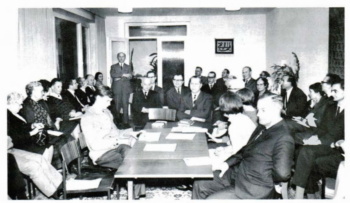
First seminar held in Langenhainer, near Bahá'í House of Worship in Germany. The second seminar was held in mid-May and four more are scheduled.

Plans for four additional seminars are now being made as part of a long-range teaching program in Langenhainer.