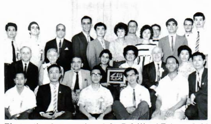
First national convention of the Bahá'ís of Taiwan, held April 28-30, 1967 at Taipei, Taiwan, R.O.C.

In a special message from the Universal House of Justice, the new national assembly was made responsible for eleven goals during the remainder of the Nine Year Plan. More than twenty greetings were received from national and local assemblies and from individuals throughout the world.