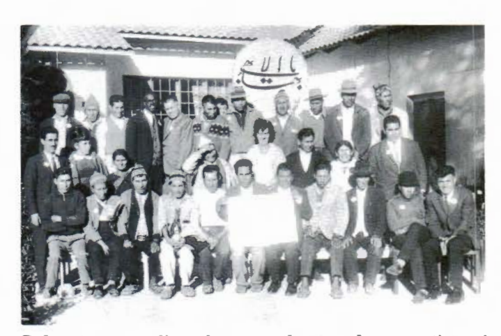
Delegates attending the seventh annual convention of the Bahá'ís of Bolivia