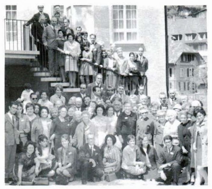
Sixth national convention in Bern, Switzerland, held April 29-30. The Faith is making good progress in the Alpine country. The harmony and dedication of the Helvetic Bahá'í community was evident in the fine spirit of the Swiss convention.