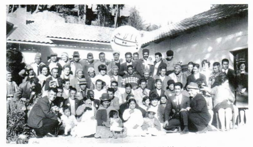
Seventh annual convention of the Bahá'ís of Bolivia.