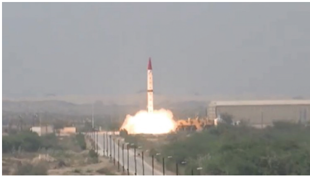
Figure 2. The Pakistani army test-launched a Shaheen-III medium-range ballistic missile in April 2022.

its weapons” (Carnegie Endowment for International Peace 2015, 10). But for a 2,750-km range Shaheen-III to reach the Andaman and Nicobar Islands, it would need to be launched from positions in the very Eastern parts of Pakistan, close to the Indian border.