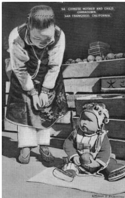
"Chinese Mother and Child, Chinatown, San Francisco, California," ca. 1910.