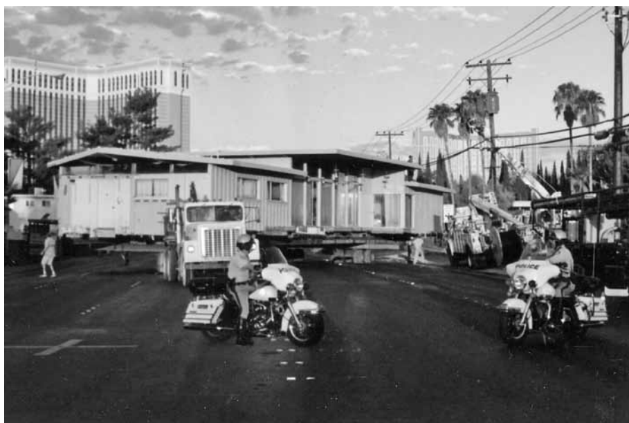
Morelli House being moved down Fremont Street, 2001.