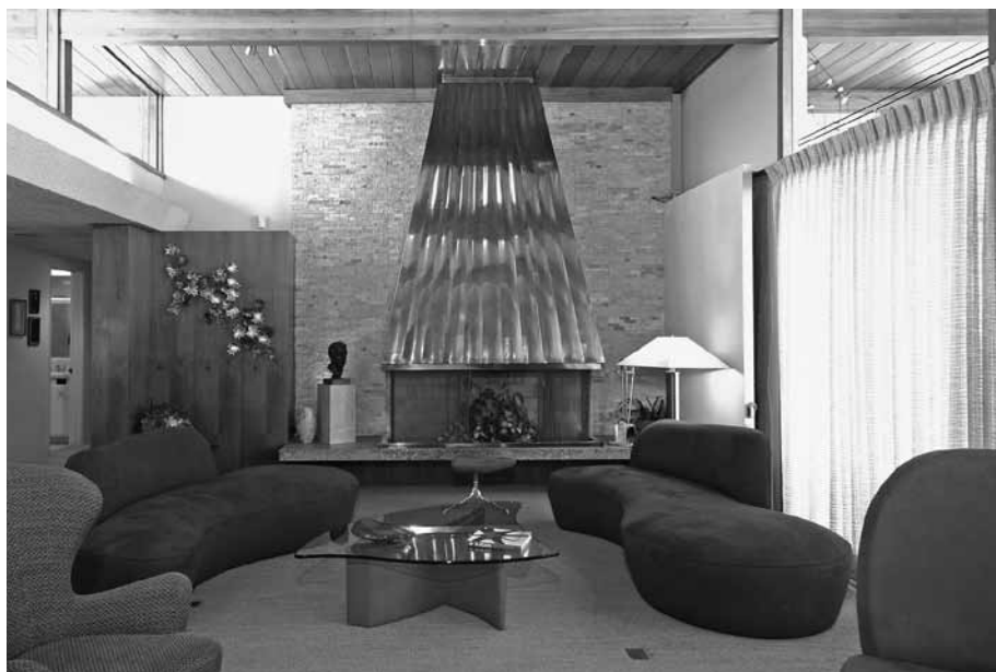
Current view of the living room in the Morelli House, 2007.