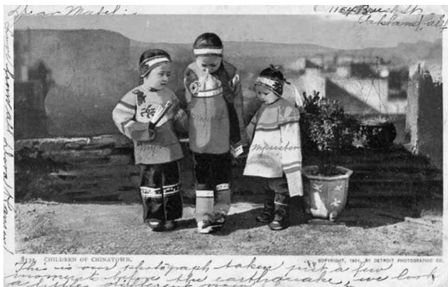
"Children of Chinatown," ca. 1904. Postmarked 1906. Published by Detroit Photographic Co.

appear over-all to be positive in promoting a common vision of childhood innocence, by calling attention to the distinctive clothing of the individuals in the postcards the writers define Chinese women and children as foreign and separate from American culture. 23 This is even more ironic given that most Chinese children at this time were born in America, spoke English, and attended the public schools. Many Chinese-American families had converted to Christianity and adopted western-style clothing. A distinctly Chinese-American culture was emerging as individuals selectively adopted aspects from both cultures, but policies of segregation and exclusion refused them full entry into American society.