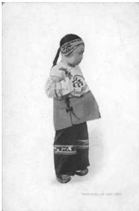
"Troubles of His Own," ca. 1901. Published by Detroit Photographic Co.