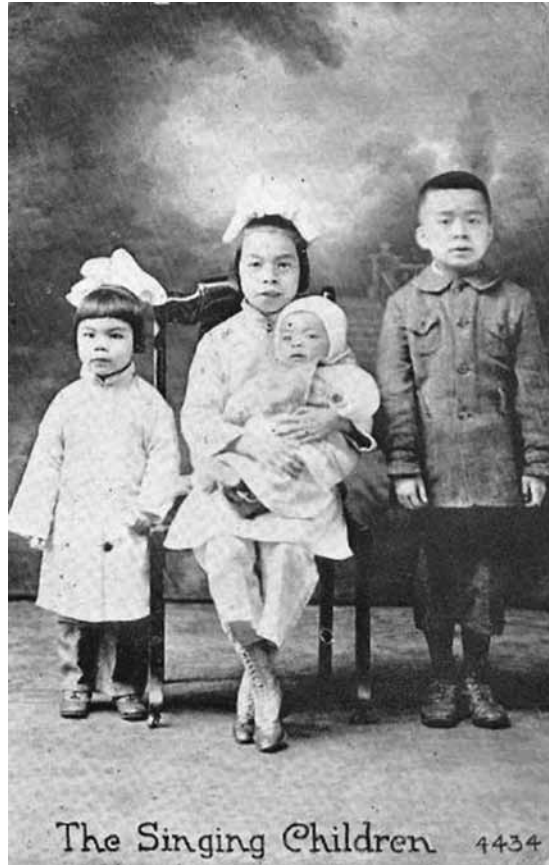
"The Singing Children," ca. 1910. Published by Pacific Novelty Company. San Francisco, California.