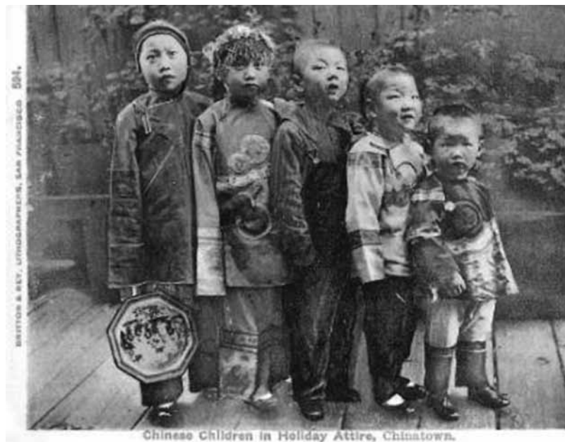
"Chinese Children in Holiday Attire," ca. 1907. Published by Britton and Rey, San Francisco.