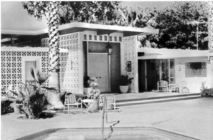
Historic view of the Morelli house's front door showing swimming pool, ca. 1963.