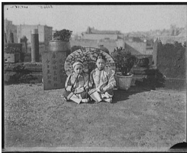
"Chinese Subjects," ca. 1901.