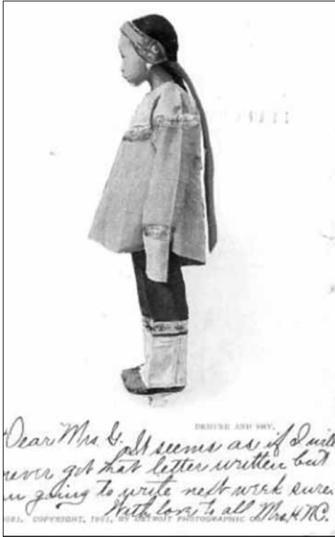
"Demure and Shy," ca. 1901. Postmarked 1907. Copyright 1901. Published by Detroit Photographic Co. (Wendy Rouse Jorae)