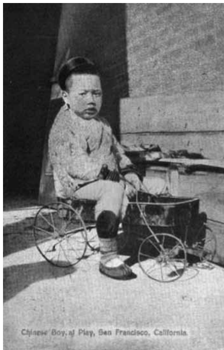
"Chinese Boy at Play, San Francisco, California." Postmarked 1910. Published by Pacific Novelty Company.