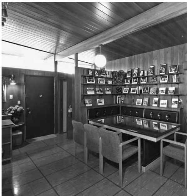
Current view of the breakfast nook, 2007.