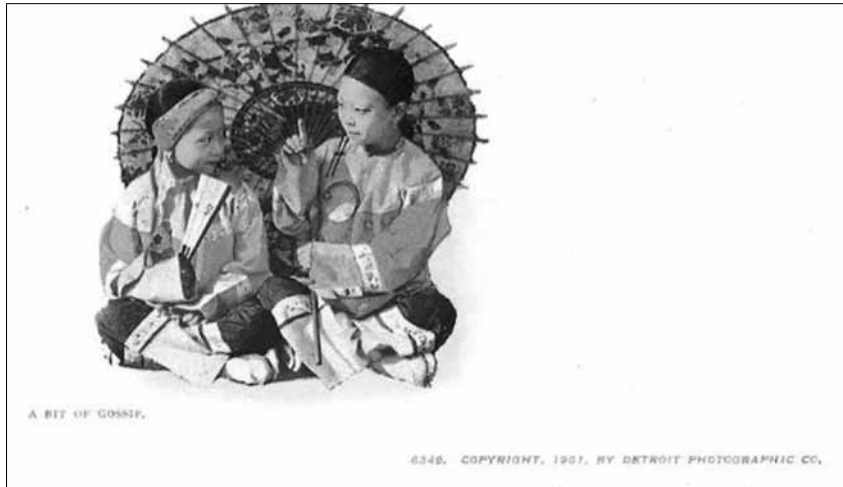
"A Bit of Gossip," ca. 1901. Published by Detroit Photographic Co. ( Wendy Rouse Jorae )

American society, the very production of these images of Chinese childhood countered the invisibility of Chinese family life as perpetuated by anti-Chinese rhetoric. In a sense, then, the creation and distribution of these postcards helped to increase the visibility and to humanize the Chinese-American community for white audiences. The actual reactions of the individuals who purchased, sent, and received the postcards were no doubt more varied and nuanced. A careful reading of the messages inscribed on the cards can help illuminate their thoughts.