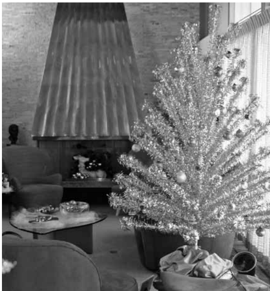
Christmas at the House, 2008.