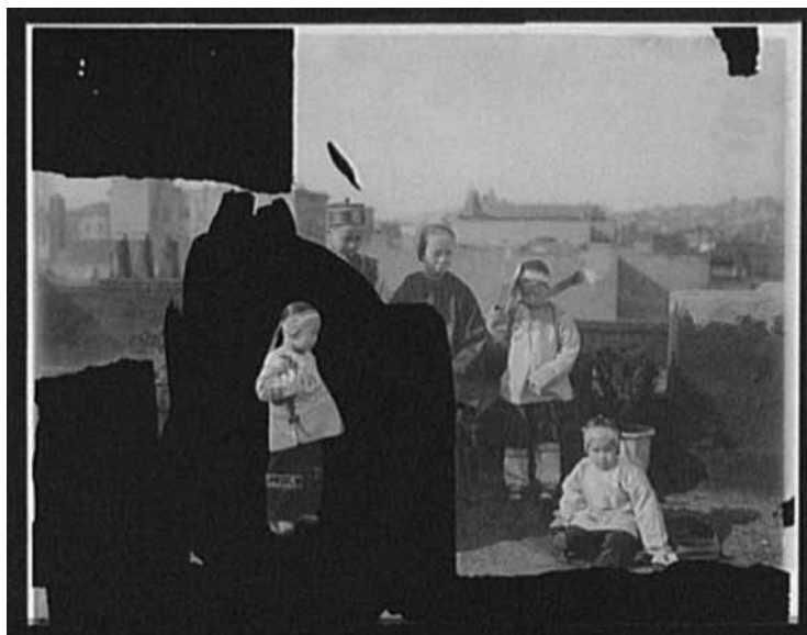
"Chinese," ca. 1901.