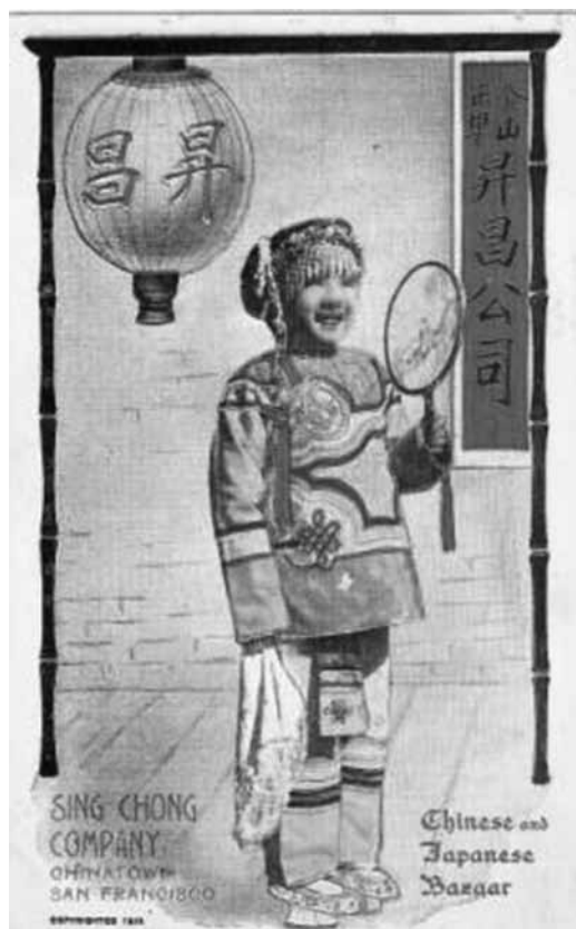
“Sing Chong Company, Chinatown, San Francisco,” ca. 1905. Publisher unknown.

of white audiences. However, this family’s success in benefiting financially from the curiosity of tourists about Chinese family life reveals their effort to take some ownership of the images and to control their own lives. Tourist guidebooks often describe the family as “Christianized Chinese” in an effort to separate them from the mass of “heathen Chinese children.” The western attire of the children suggests that their parents sought to set them apart from the Orientalized stereotypes of Chinese children. The family were fighting their own battle against the dominant image of an exotic Chinatown, even as they profited from the traveler’s attraction to it. Some Chinese resented the tourists and those within their community who made a living by catering to them. Yet, the production of postcards and staged performances of Chinese childhood offered a safe, public venue for outsiders to experience “genuine”