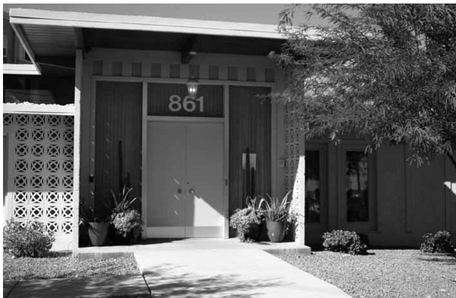
Current view of the front door of the Morelli House, 2007.