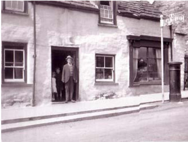
Castle Street during the 1910s