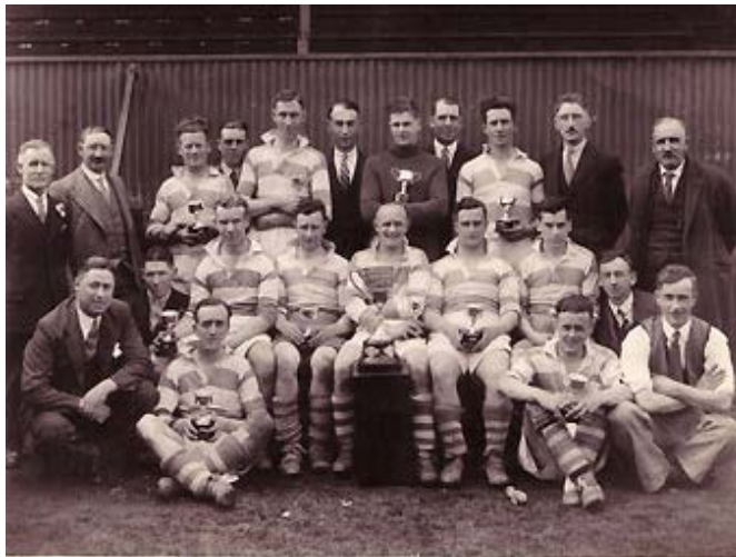
Hay Football Team