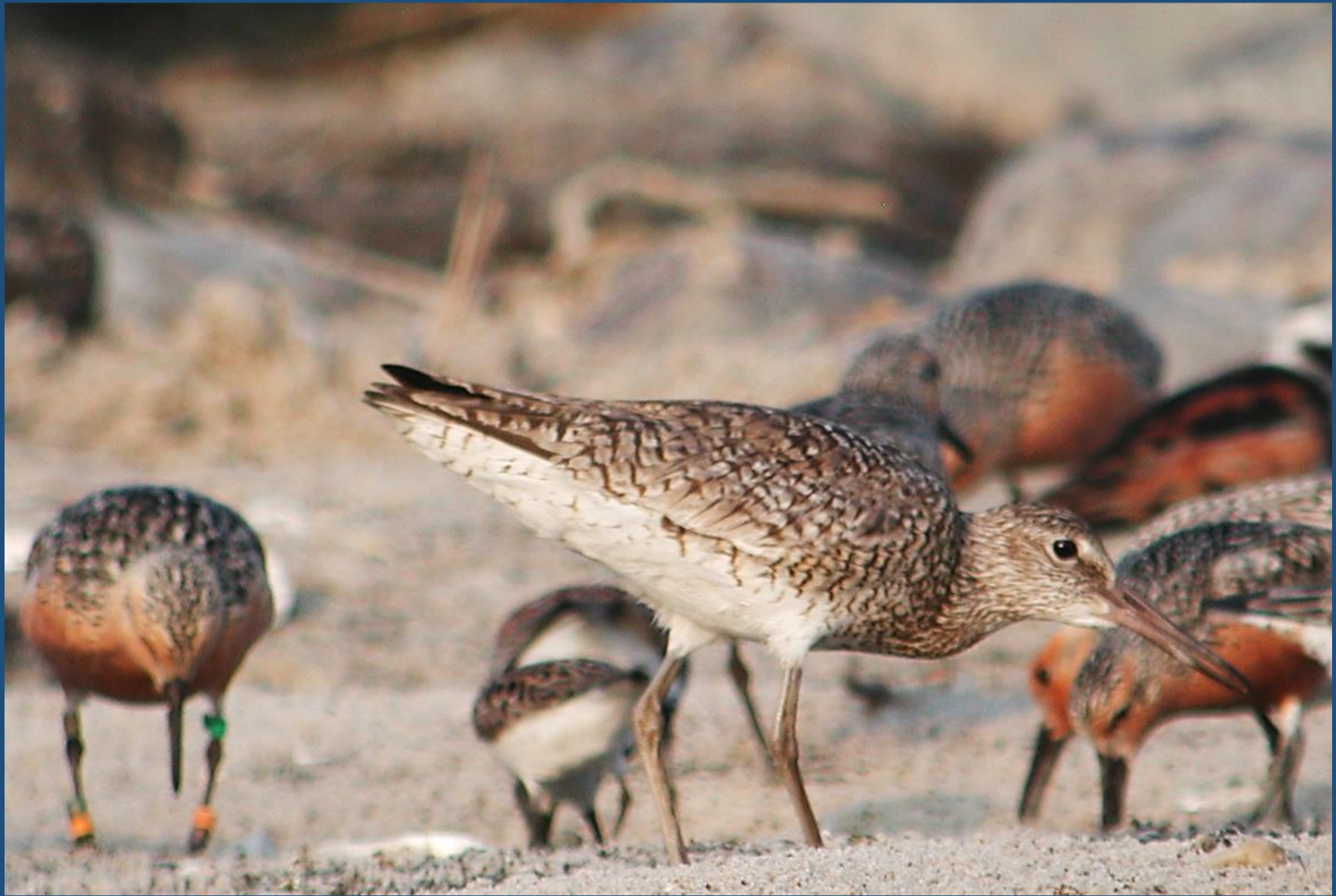
Red knot and willet