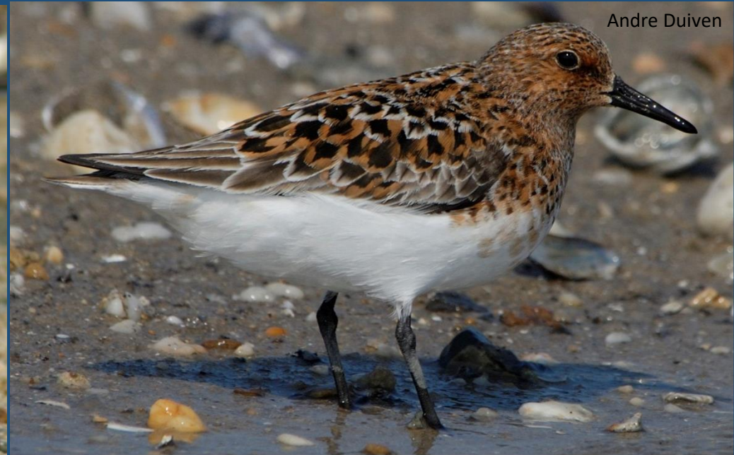
Sanderling with alternate plumage