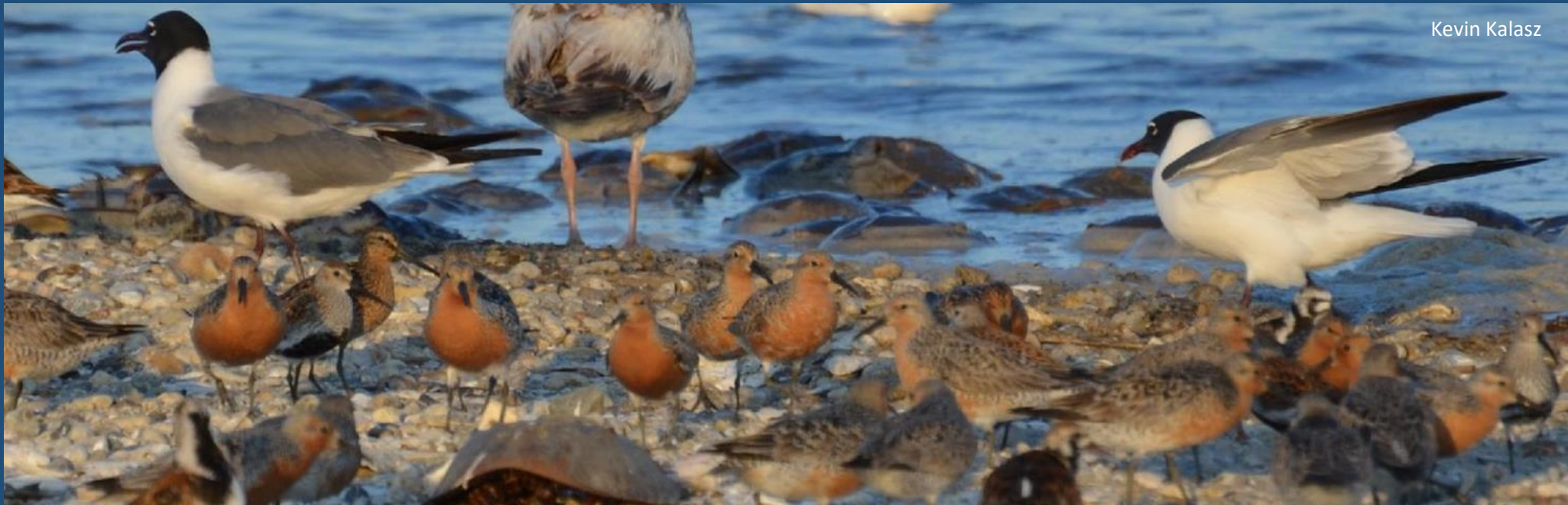
Flock of red knot among laughing gulls