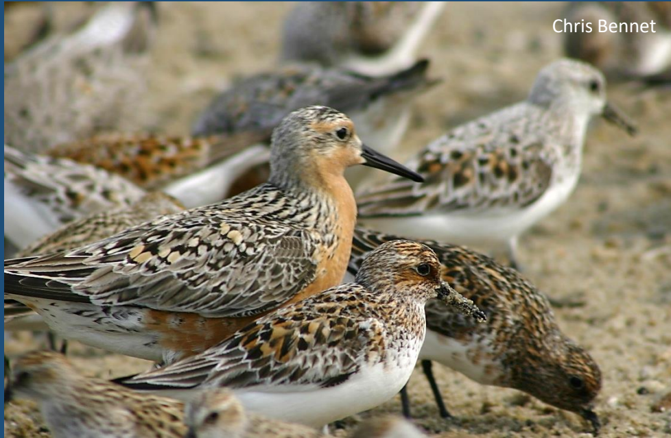
Red knot and sanderling