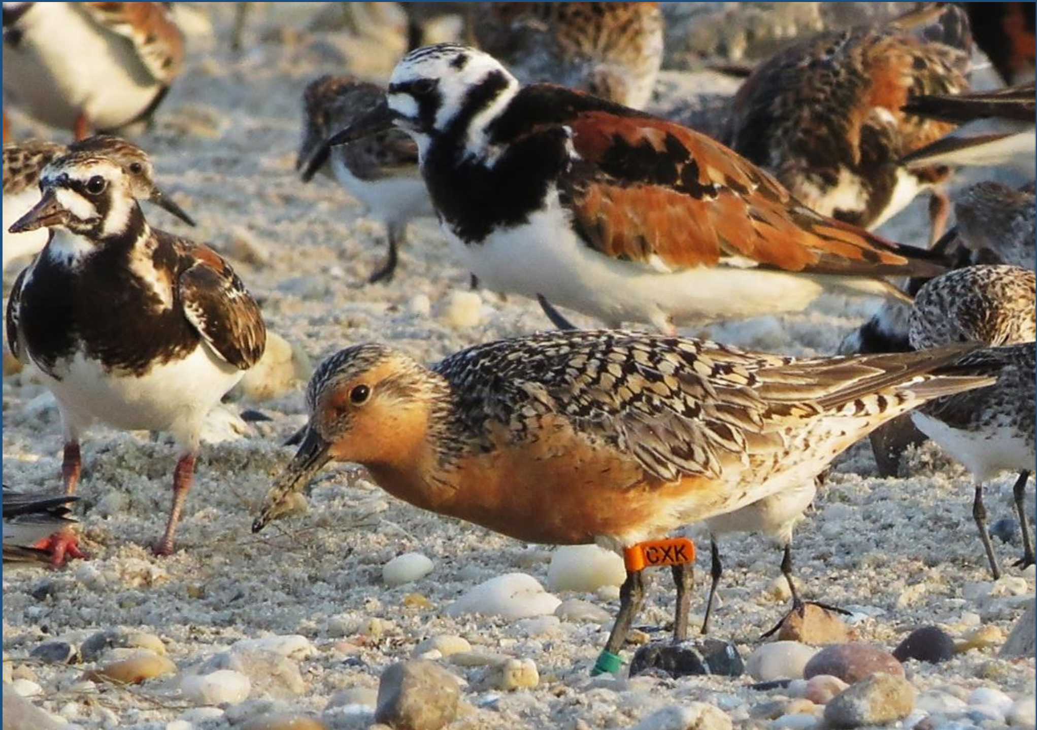
Ruddy turnstone with red knot