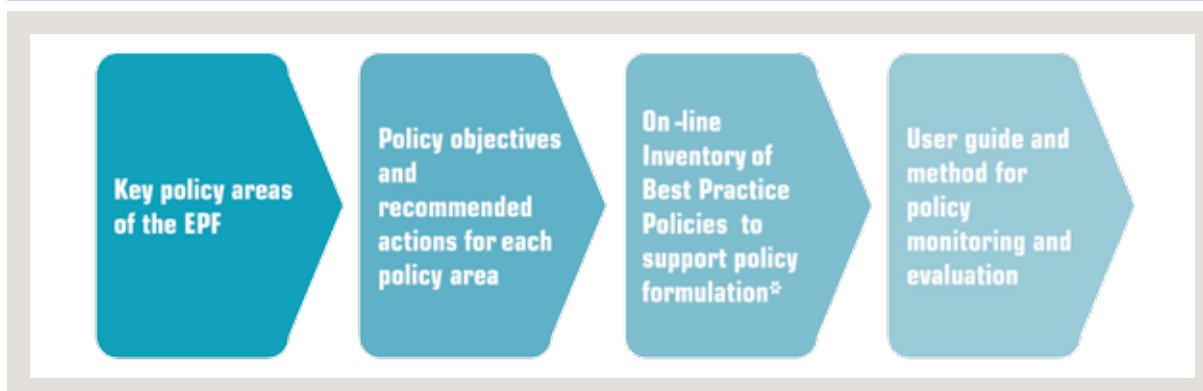
Figure 3. Structure of UNCTAD’s Entrepreneurship Policy Framework and Entrepreneurship Policy Toolkit

The policy framework and its toolkit elements include the work of four UNCTAD Inter-governmental Multi-Year Expert Meetings held from January 2009 to January 2012 as well as a series of international expert meetings organized by the Secretariat. It represents a baseline document for UNCTAD to assist policymakers in evaluating the state of entrepreneurship in a specific country, and to make sound policy recommendations. It is also meant to serve as a useful document to foster policy dialogue on entrepreneurship. In order to accommodate suggestions and improvements that may result from such dialogue, the Entrepreneurship Policy Framework has been designed as a “living document”. UNCTAD will aim continuously to integrate learning from technical assistance work on entrepreneurship development. Finally, the online inventory of best practice policies will provide the opportunity for all stakeholders to contribute cases, examples, comments and suggestions, as a basis for the inclusive development of future entrepreneurship policies.