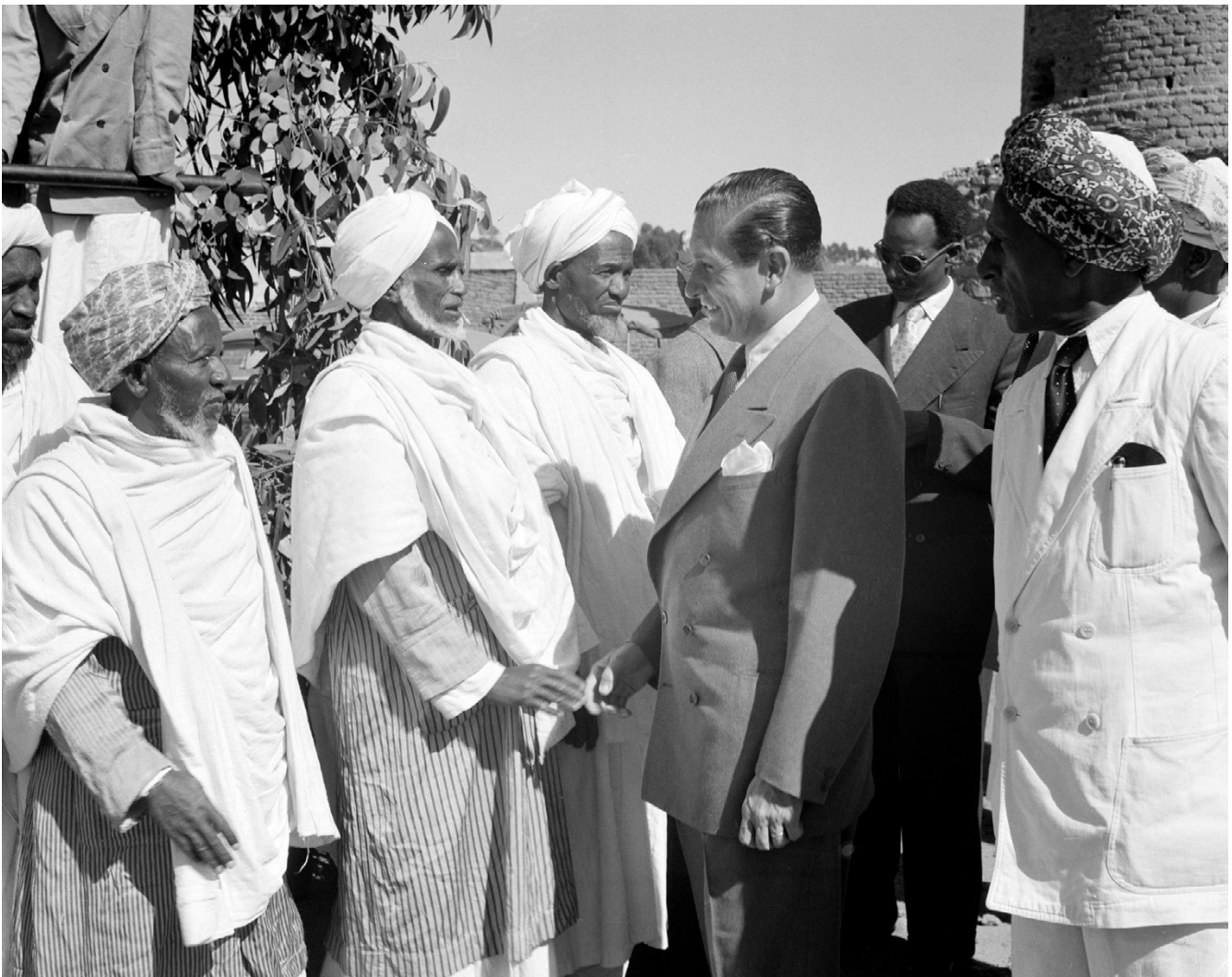
Eduardo Anze Matienzo (second from right), United Nations Commissioner in Eritrea, visits Eritrea.

6. Through the early 1960s, the United Nations deployed a wide range of political missions in response to the complex situations confronting the international community at the time, such as the need to mediate disputes in the Middle East and South Asia or to support the transition to independence in countries under colonization in Africa and Asia. During that formative period, the Organization also deployed several different types of missions. Those included, for example, the deployment of small political offices that carried out facilitation tasks, such as the United Nations presence in Jordan, established by the General Assembly in 1958. In other cases, political missions established in the context of decolonization assisted countries with constitution-making and the building of administrative institutions, as was the case with the United Nations Commissioners in Eritrea and Libya. 2