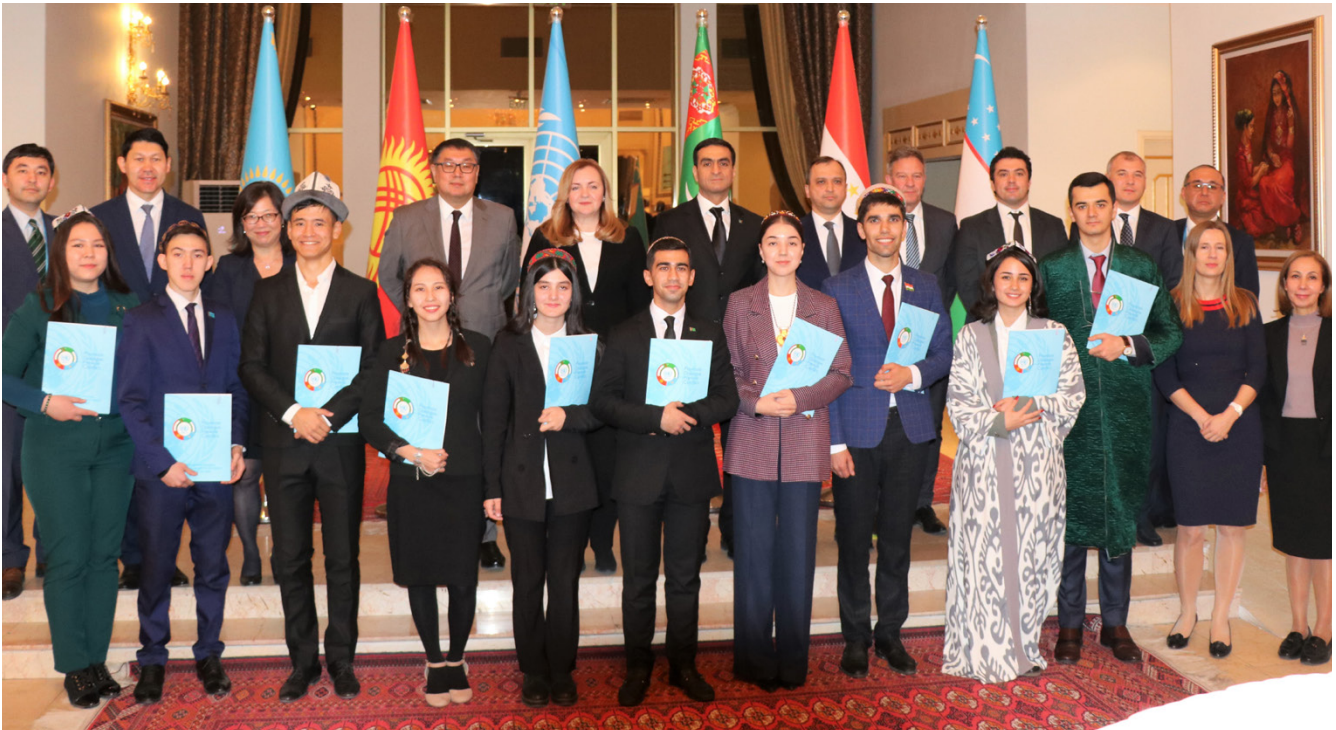
The United Nations Regional Centre for Preventive Diplomacy for Central Asia (UNRCCA) hosts the Fourth Dialogue between the Governments and Youth of Central Asia in Ashgabat, Turkmenistan.