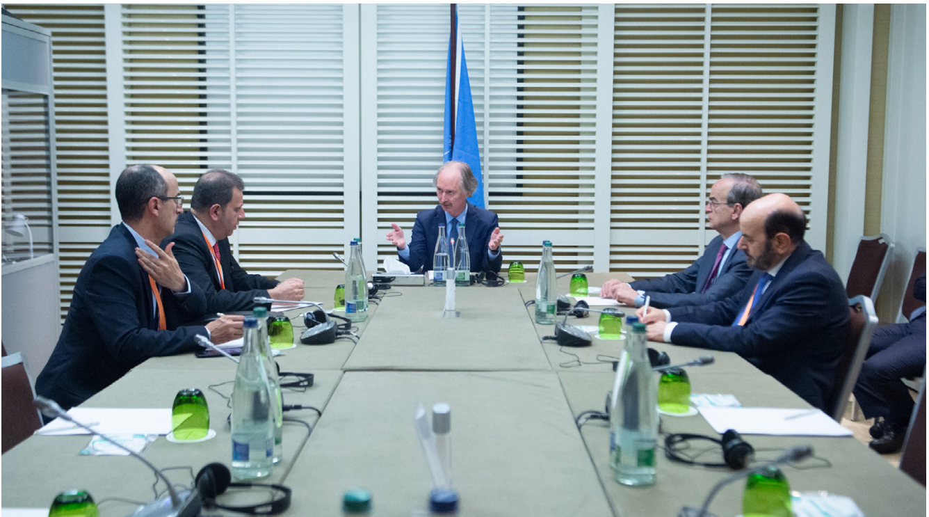
Geir Pedersen (center), Special Envoy of the Secretary-General for Syria, convenes the Syrian Constitutional Committee with the co-chairs in Geneva.