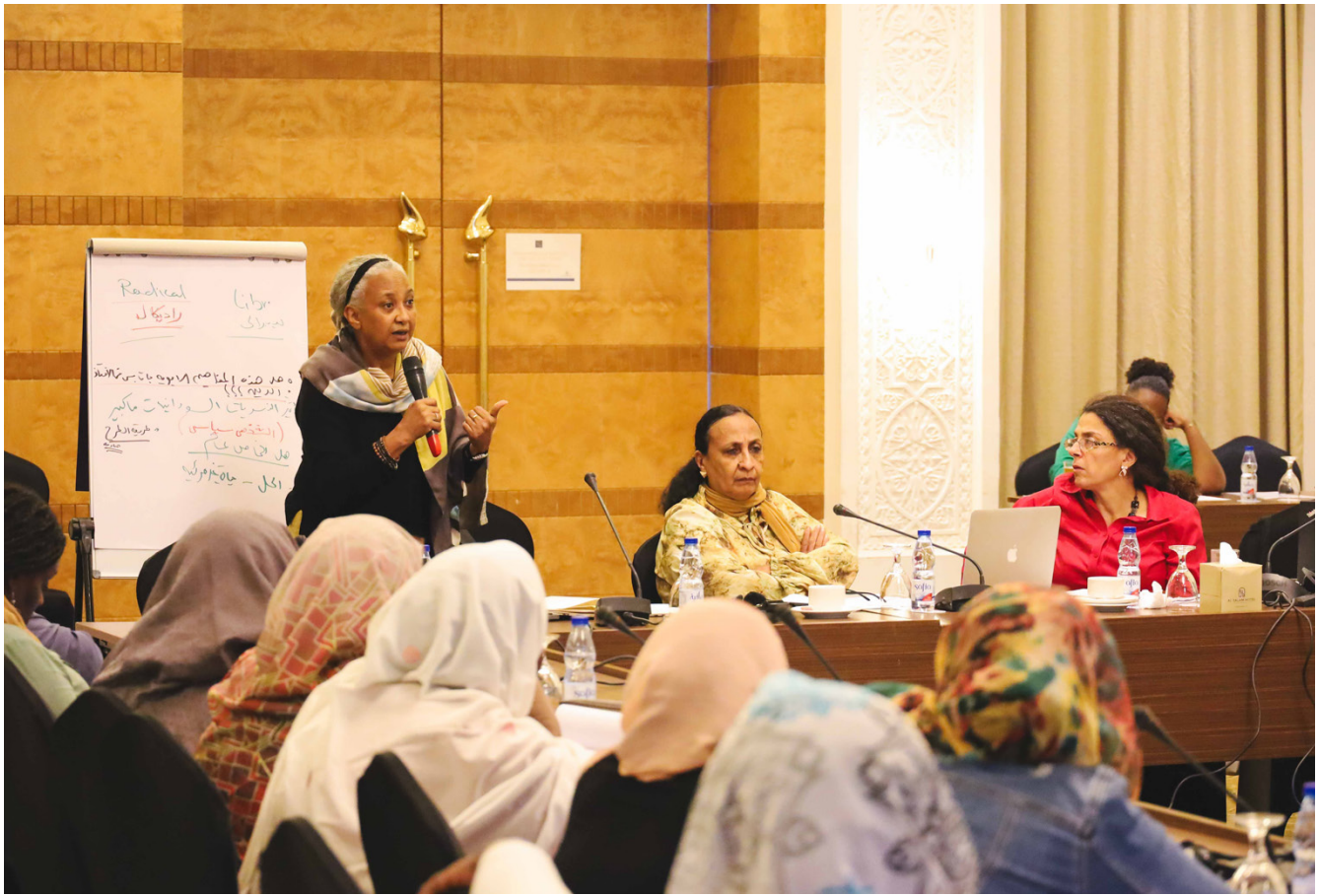
A Sudanese woman speaks at a workshop on women's leadership and participation organized by the United Nations Integrated Transition Assistance Mission in Khartoum on 1 December 2022.

11. Since the early years of the United Nations, the international community has relied on special political missions to address a range of complex threats to international peace and security. Yet, in some cases, their impact is hampered by political dynamics on the ground, a lack of commitment to peace by the parties or the lack of unified support by the Security Council. Nevertheless, their flexibility and adaptability have made them a central component of the toolbox available to Member States to prevent and resolve conflicts and sustain peace. The successful closure of several missions, such as the United Nations Integrated Peacebuilding Office in Sierra Leone, highlights the fact that special political missions are not designed to be permanent fixtures, but rather mechanisms deployed for specific tasks. The views of Member States on the role of the missions have evolved in response to changing circumstances on the ground, which often required special political missions to adapt. This adaptability and capacity for rapid response have proven critical to their work, allowing these missions to occupy a vital space in the spectrum of peace and security mechanisms that the United Nations can offer to Member States.