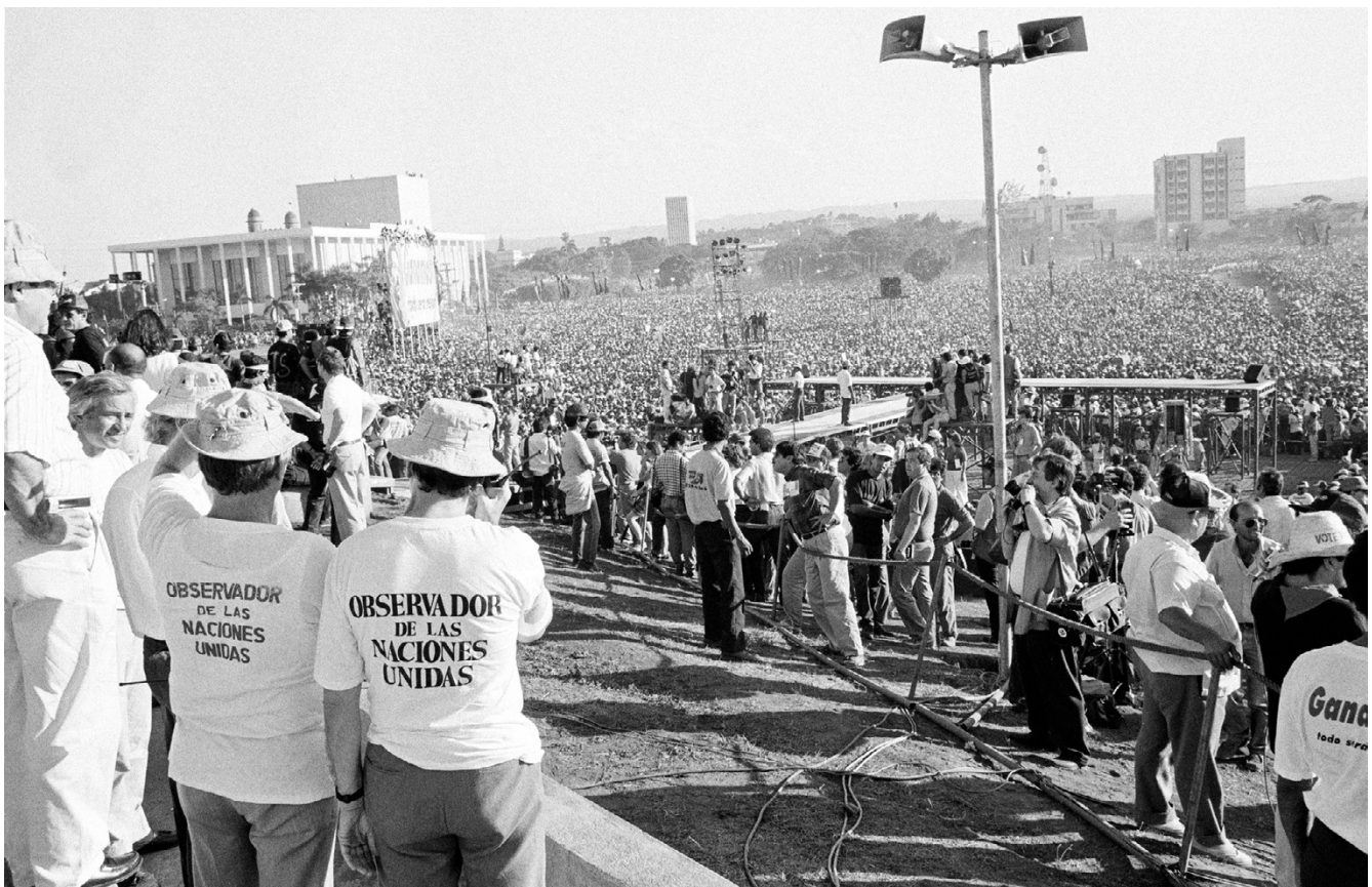
The United Nations Observer Mission in Nicaragua monitor a political rally in Managua.

8. The end of the cold war presented new opportunities for collective security and special political missions. The political transitions witnessed in many parts of the world resulted in increased requests from Member States for United Nations assistance, in particular in areas such as mediation and the provision of good offices in support of regional efforts to restore constitutional order following unconstitutional changes of government; electoral support; constitution-making; reconciliation; and the rule of law. In response, the United Nations established new missions in Asia, Africa and Central America to help Member States address those needs. For instance, in 1993, at the request of the General Assembly, the Secretary-General dispatched a Special Mission to Afghanistan with a mandate to canvass a broad spectrum of the leaders of Afghanistan to solicit their views on how the United Nations could best assist Afghanistan in facilitating national rapprochement and reconstruction. 3 United Nations political offices were established in Burundi in 1993 and Somalia in 1995 to advance peace and reconciliation in these countries. Electoral support was also a central focus of some of the political missions mandated during the late 1980s and 1990s, such as the United Nations Observer Mission to Verify the Electoral Process in Nicaragua and the United Nations Observer Group for the Verification of Elections in Haiti.