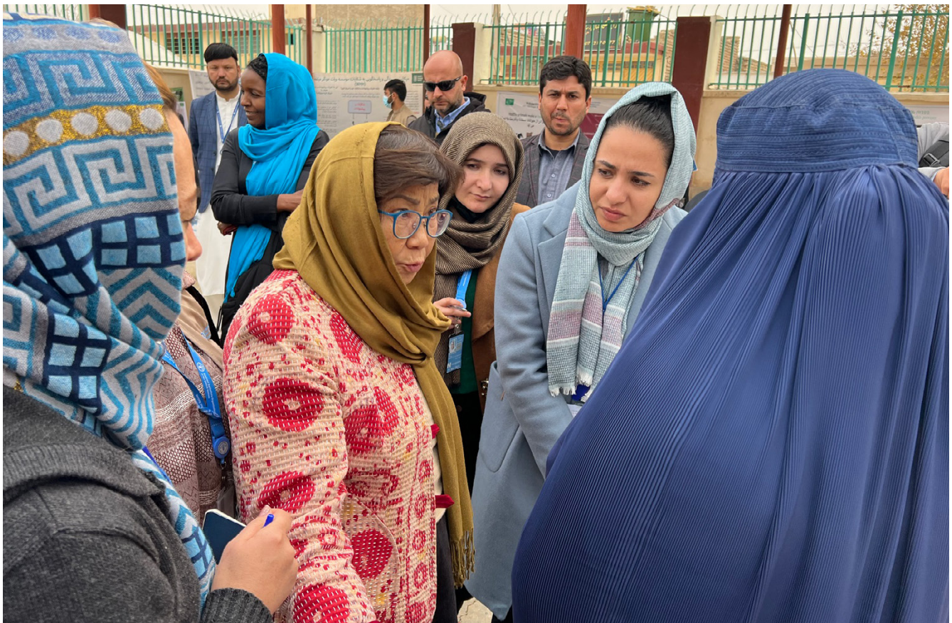
Roza Otunbayeva, Special Representative of the Secretary-General and Head of the United Nations Assistance Mission in Afghanistan (UNAMA), visits a project site in Mazar-i-Sharif and engages in conversation with female beneficiaries.

34. The Security Council, in its resolution 2678 (2023), extended the mandate of the United Nations Assistance Mission in Afghanistan (UNAMA) until 17 March 2024. In resolution 2679 (2023), the Security Council requested the Secretary-General to conduct and provide an integrated, independent assessment no later than 17 November 2023, to offer recommendations for an integrated and coherent approach to address the current challenges faced by Afghanistan. On 5 April, the de facto Minister for Foreign Affairs, Amir Khan Motaqi, verbally notified the Special Representative of the Secretary-General for Afghanistan and Head of the United Nations Assistance Mission in Afghanistan the decision to impose severe restrictions on national female staff working for the United Nations with immediate effect. The United Nations condemned the decision and requested United Nations national personnel – women and men – not to report to United Nations offices, with limited exceptions made for the performance of critical tasks. This posture remains in place for UNAMA and is under constant monitoring. UNAMA continues in all its interactions with the de facto authorities to seek a reversal of the severe restrictions.