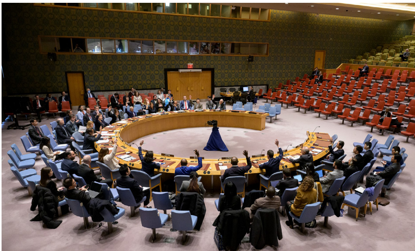
The Security Council unanimously adopts resolution 2680 (2023) on Non-proliferation, extending the mandate of the Panel of Experts on the Democratic People's Republic of Korea until 30 April 2024, as specified in paragraph 26 of resolution 1874 (2009).