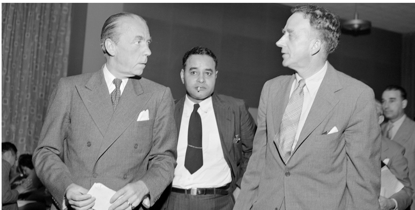
Folke Bernadotte (left), United Nations Palestine Mediator, Ralph Bunche (center), Principal Secretary of UN Palestine Commission and representative of the Secretary-General, and Philip C. Jessup (right), Assistant on Judicial Organization of the United States, arrive at the Security Council meeting on Palestine.