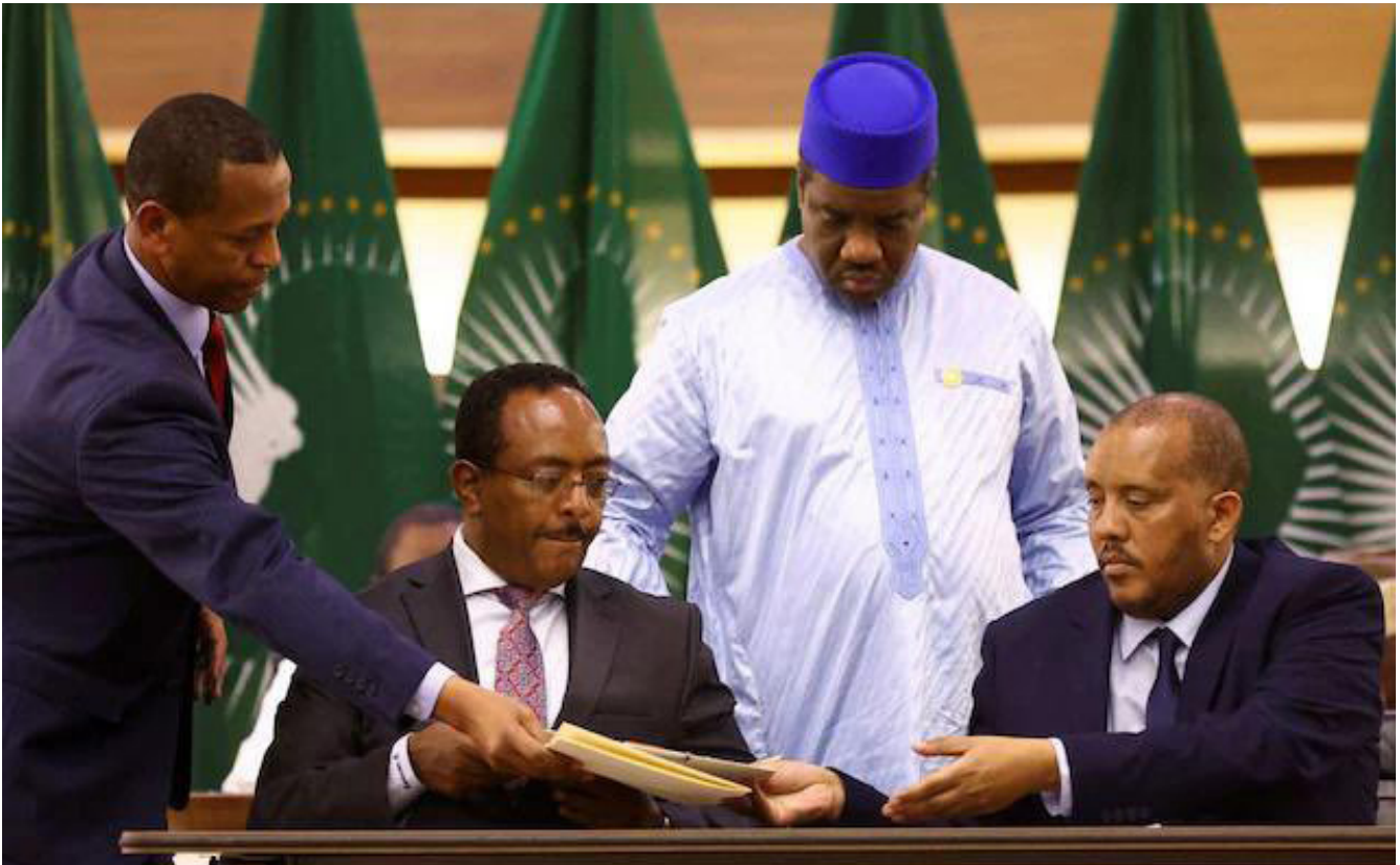
Redwan Hussein Rameto (left) from the Ethiopian government, and Getachew Reda (right), who represents Tigray People's Liberation Front (TPLF) sign the Agreement for Lasting Peace through a Permanent Cessation of Hostilities (CoHA) on 2 November 2022 in Pretoria, South Africa.

26. The Office of the Special Envoy of the Secretary-General for the Horn of Africa coordinated and enhanced the coherence of the collective work of the United Nations in the region to support countries in their pursuit of lasting peace and sustainable development. The Special Envoy carried out her good offices efforts in relation to the situation in Ethiopia, engaging with the Federal Government of Ethiopia and the Tigray People's Liberation Front, the African Union, the Intergovernmental Authority on Development (IGAD), and other partners to advance the peace process. The Office of the Special Envoy provided technical and advisory support to IGAD and coordinated the implementation of the review of the United Nations Regional Prevention Strategy for the Horn of Africa.