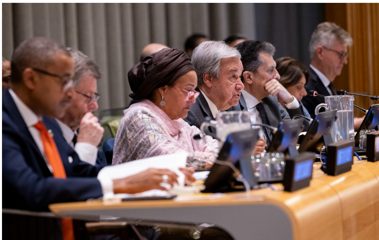
Secretary-General António Guterres (center) releases a new Our Common Agenda policy brief, ‘A New Agenda for Peace’.