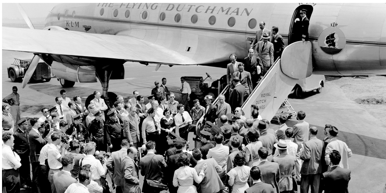
Trygve Lie, Secretary-General of the United Nations, greets Count Folke Bernadotte, United Nations Palestine Mediator, and spouse Estelle Manville-Bernadotte, upon their arrival at La Guardia Airport.