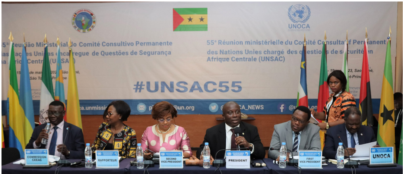
The United Nations Regional Office for Central Africa (UNOCA) serves as the secretariat of the United Nations Standing Advisory Committee on Security Questions in Central Africa.

29. The Special Representative of the Secretary-General for Central Africa and Head of UNOCA conducted good offices pertaining to the political transition in Chad. He also undertook good offices in Sao Tome and Principe, which he visited jointly with the President of the Commission of the Economic Community of Central African States in the aftermath of the events of 25 November 2022. UNOCA continued to serve as the secretariat of the United Nations Standing Advisory Committee on Security Questions in Central Africa, which provided a framework for confidence-building, conflict prevention and resolution for the States in the subregion.