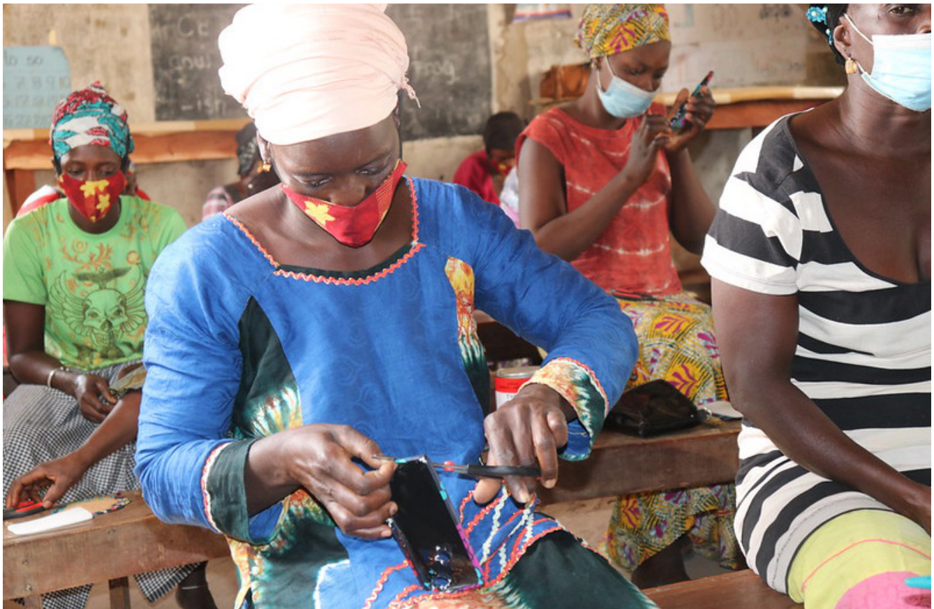
The Peacebuilding Fund has been an early responder to the transition priorities in The Gambia, with critical support in the areas of transitional justice and women and youth empowerment.

63. In West Africa, the Peacebuilding Fund collaborated with UNOWAS, the United Nations country teams and regional partners in identifying peacebuilding priorities and maximizing the collective impact of United Nations peacebuilding activities in the region. The Fund's support in West Africa has been affected and informed by the recent complex political and regional developments, including unconstitutional changes of government in multiple countries, instability around elections and the spread of terrorism and violent extremism. In Guinea, the Peacebuilding Fund has supported the country after the 2021 military coup and is currently funding several initiatives aimed at a more peaceful and inclusive transition.