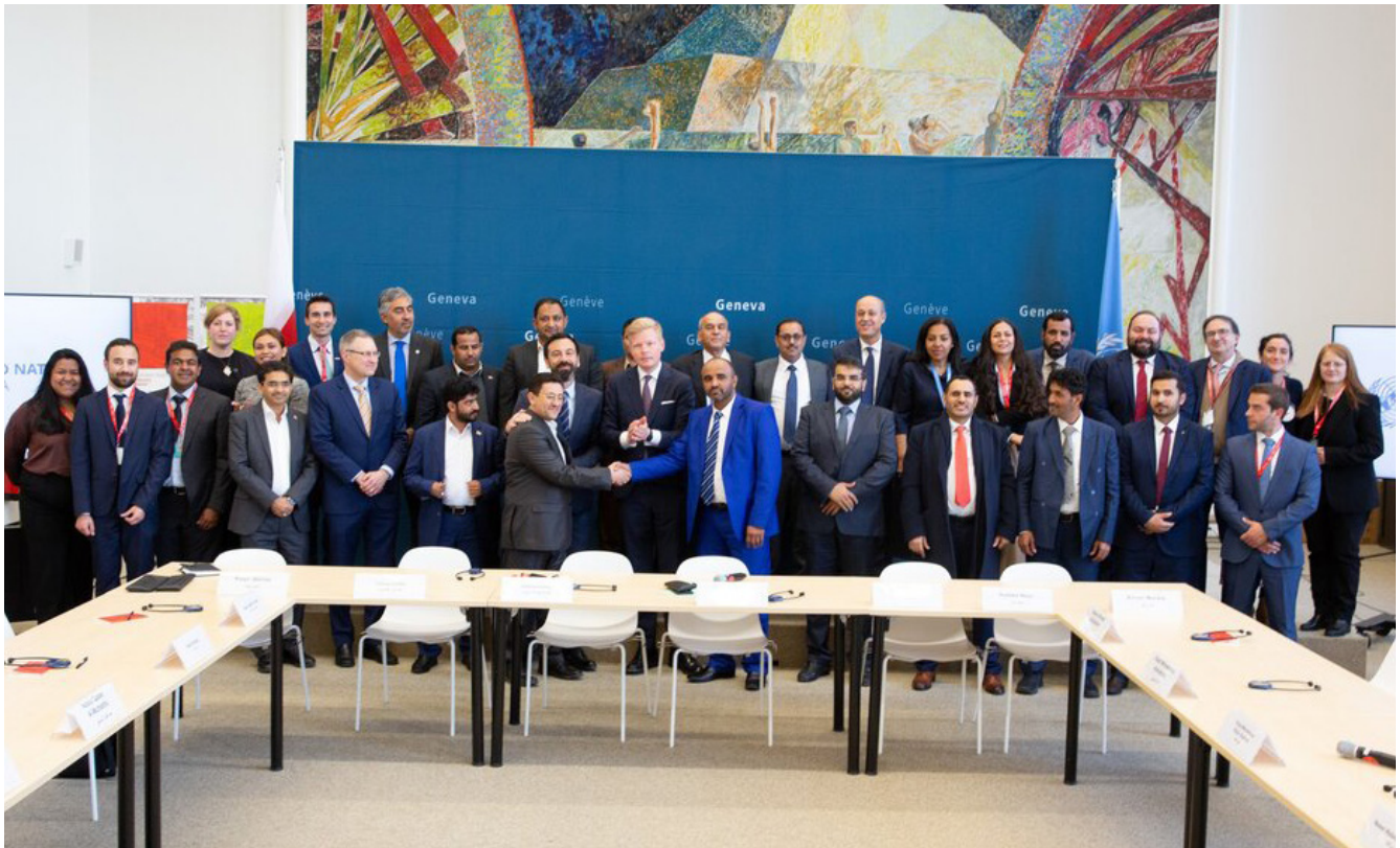
Hans Grundberg, Special Envoy of the Secretary-General for Yemen, congratulates as the parties to the conflict in Yemen finalize the implementation plan for the release of 887 conflict-related detainees.

43. The Special Envoy of the Secretary-General for Yemen engaged with a range of Yemeni stakeholders, with the aim of launching an inclusive, multitrack political process to end the conflict. Despite the expiration in October 2022 of the truce brokered by the United Nations, levels of violence remained at their lowest since the onset of the conflict in 2015. Many elements of the truce continued to benefit the population, in particular the entry of fuel and goods into Hudaydah ports and commercial flights from Sana'a airport. There have been neither Houthi cross-border attacks on neighbouring countries nor Saudi-led coalition air strikes in Yemen.