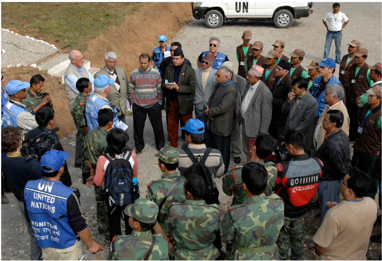
Civilian and military personnel of the United Nations Mission in Nepal (UNMIN) meet with representatives of the Nepal's Seven-Party Alliance.

10. In response to the outbreak of conflict in different regions in the past 15 years, the United Nations established several new special political missions. These included the deployment of special envoys with the goal to stop violence and broker peace agreements, as in Myanmar, the Syrian Arab Republic and Yemen, as well as country-based missions, such as the United Nations Support Mission in Libya (UNSMIL) established in 2011. In some cases, special political missions were deployed to support positive political momentum and the implementation of a peace agreement, such as the United Nations Verification Mission in Colombia. That period also saw a significant innovation in the design of special political missions. Examples include the deployment of joint technical missions (e.g. the Joint Mission of the Organisation for the Prohibition of Chemical Weapons and the United Nations for the Elimination of the Chemical Weapons Programme of the Syrian Arab Republic), an increasing number of envoys with regional mandates (e.g. in the Horn of Africa and the Great Lakes region) and missions with a focus on the rule of law and the justice sector (e.g. United Nations Integrated Office in Haiti).