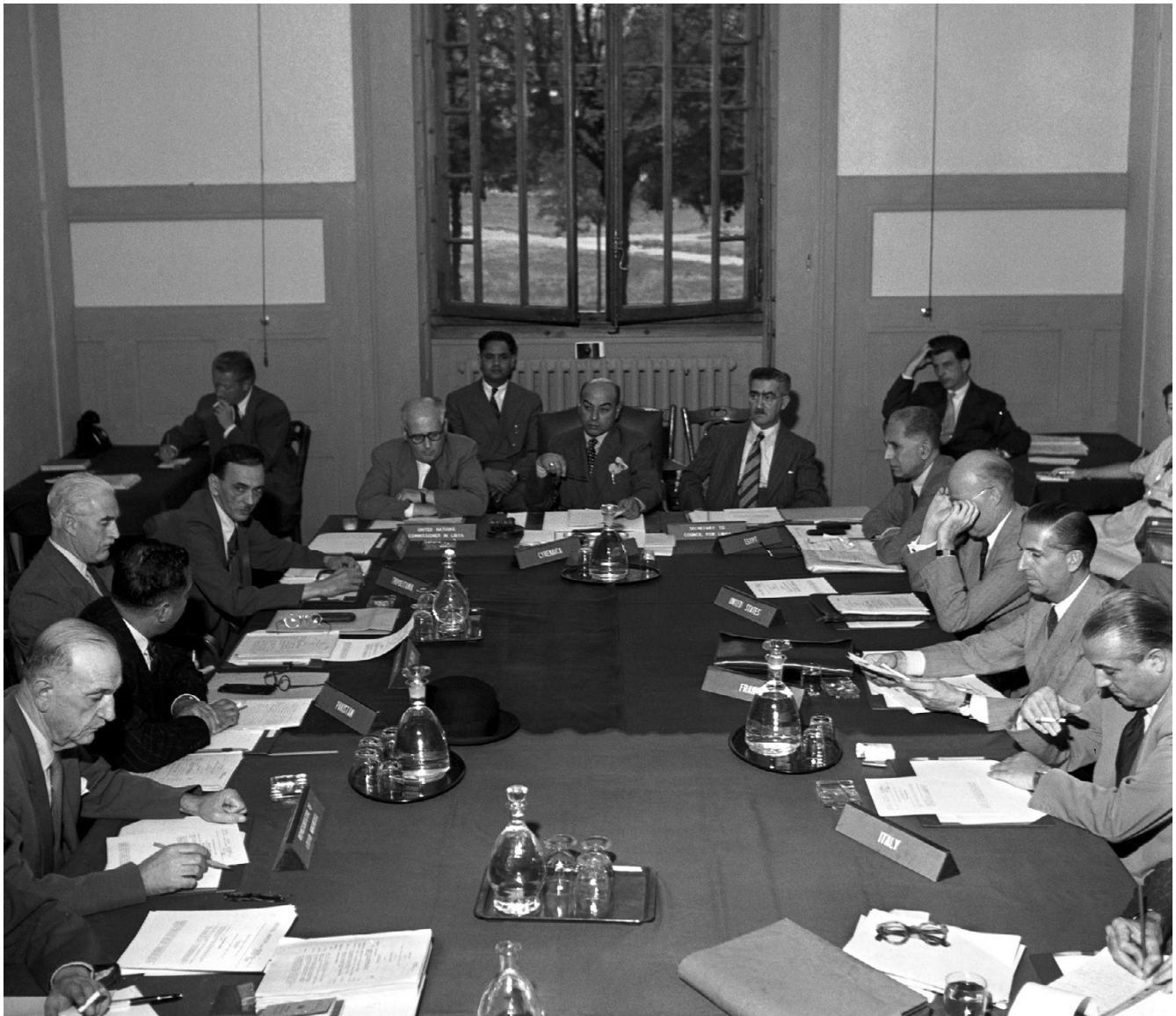
Adrian Pelt, UN Commissioner in Libya, and the Advisory Council to the United Nations Commissioner in Libya meets at the Palais Electoral in Geneva as they prepares the preliminary report for the Secretary-General ahead of the General Assembly in 1950.