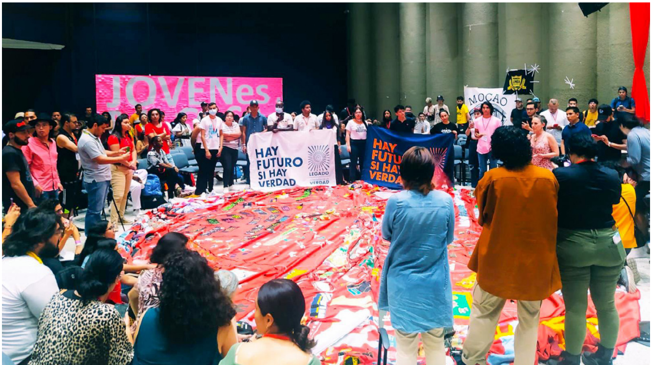
The United Nations Verification Mission in Colombia joins the national meeting, 'Young People in Movement for Cultural Change,' an initiative by the Government of Colombia that acknowledges the significant role of youth in conflict resolution, peace, and reconciliation through dialogue, art, and culture.