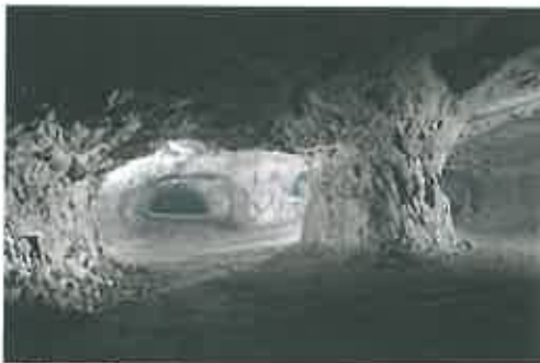
Minersa's Mina Moscona, Spain, showing chambers and pillars in a worked-out area of the stratiform mineralisation

Moreover, ICI had previously demonstrated its confidence in satisfactory acidspar imports being a realistic option when it decided in 1999 not to renew the contract for acidspar supply from Laporte's Glebe Mines, and to purchase cheaper material from China. Regarding this action, of particular note is that ICI's decision was taken despite having been reassured of supply reliability from Glebe by a positive detailed audit of the latter's mining operations carried out personally in 1990 under ICI's instructions in accordance with an agreement it made with Laporte. In fact, it was this particular decision of ICI that resulted in Laporte announcing closure of the Glebe operations after 40 years of well-managed ownership, following which the assets were sold to LRM in November 1999.