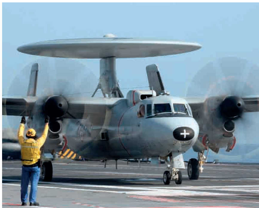
E-2C Hawkeyes are deployed aboard the French navy aircraft carrier Charles de Gaulle