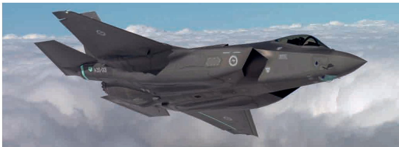
The Royal Australian Air Force's first F-35A pilots will start training on the Lightning II at Luke AFB, Arizona, in early 2015