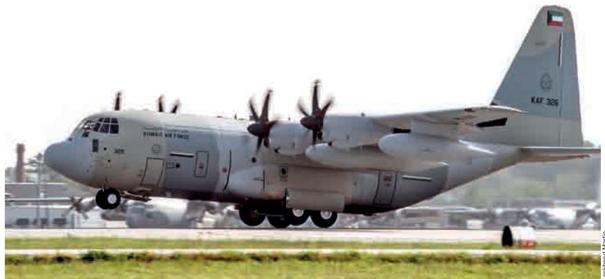
Kuwait has an option to add to its trio of newly-delivered KC-130J tankers