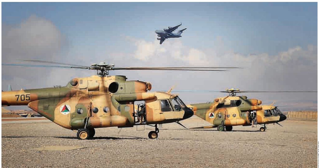
Kabul's fledgling armed forces have assumed responsibility for national security, as a coalition of NATO nations has left Afghanistan

Ongoing fleet renewals also led to some notable retirements, including that of the French air force's final Dassault Mirage F1s. The act leaves just 32 combat examples and four trainers as operational in Gabon, Iran, Libya and Morocco. Oman also during 2014 ceased operations with the Sepecat Jaguar, leaving >>