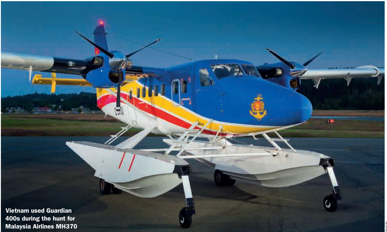
Vietnam used Guardian 400s during the hunt for Malaysia Airlines MH370