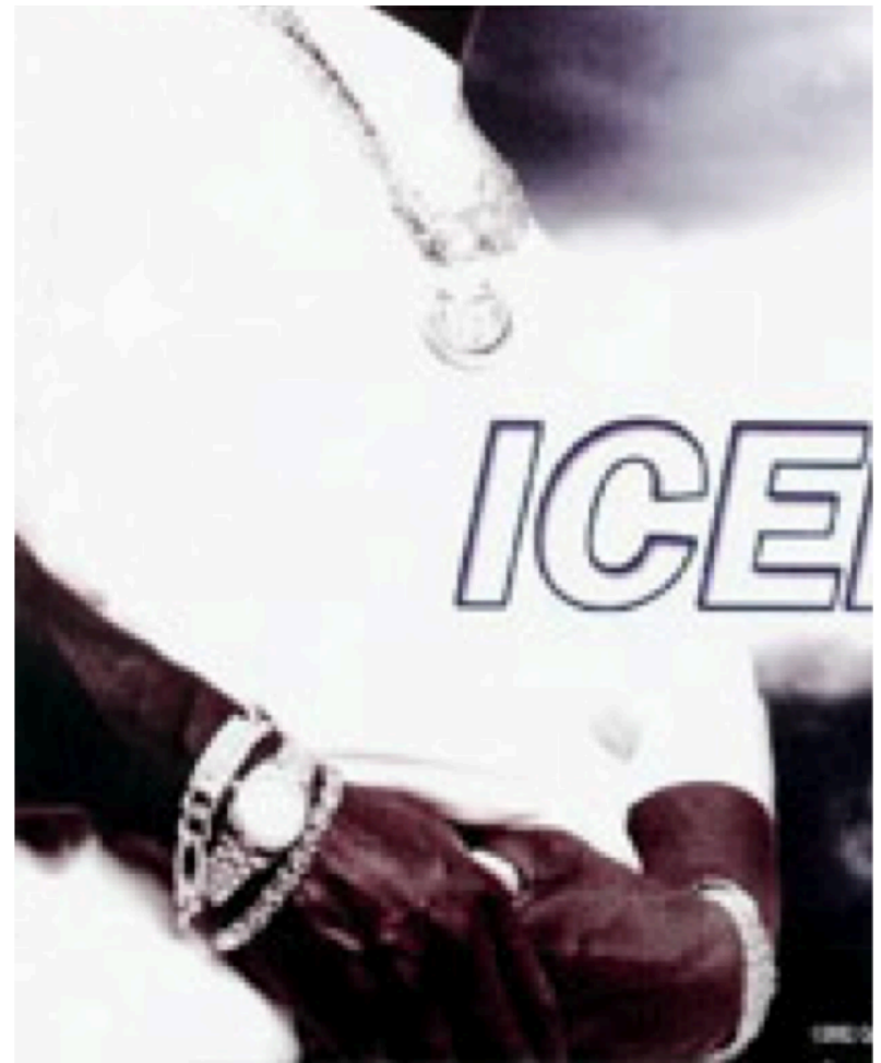
The Final Coors Billboard