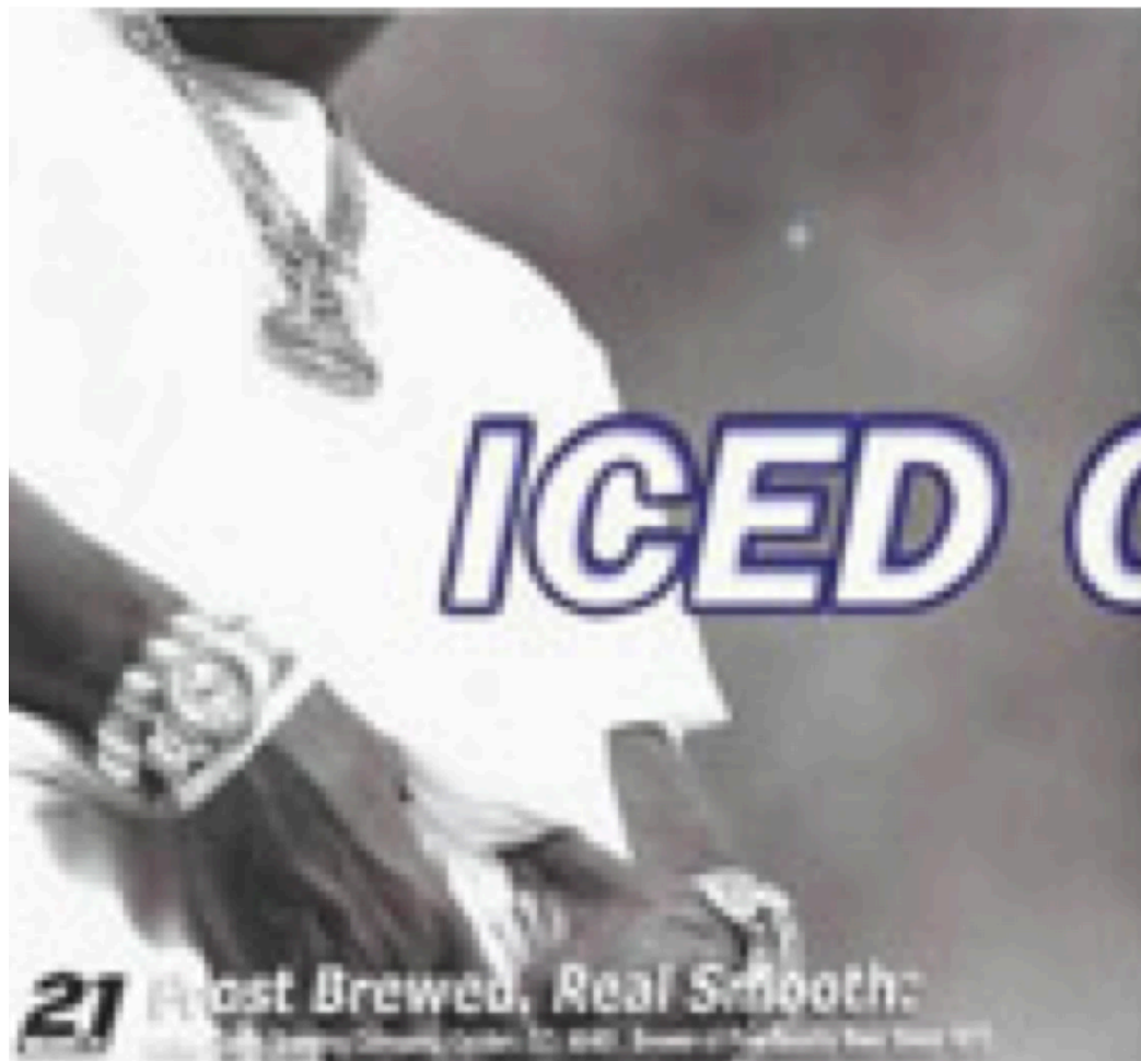
The "Comp Board"