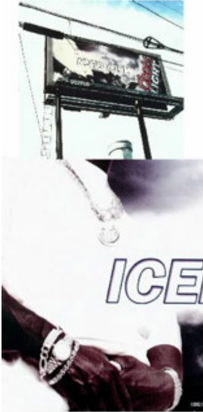
The Final Coors Billboard