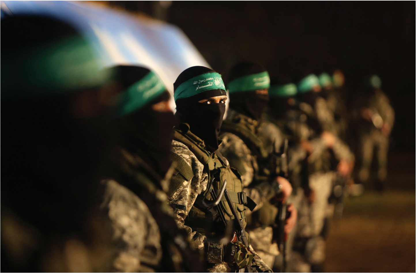
Palestinian members of the Ezzedine al-Qassam Brigades, the armed wing of the Hamas movement, are pictured on January 31, 2016, in Gaza City.

This article is divided into four main sections. In the first section, the author explores the limitations of using textual analysis and advocates for an action-oriented methodology as a more effective means to gain insight into the real-world activities of both movements. The second part delves into the dual significance of actions, while the third section highlights the advantages of employing textual analysis to uncover subtle ideological distinctions between Hamas and PIJ. Despite the merits of an action-oriented approach, the author asserts that the study of ideology remains crucial because ideas are translated into actions. Finally, the concluding section discusses the October 7 attack and what it means for our understanding of Hamas.