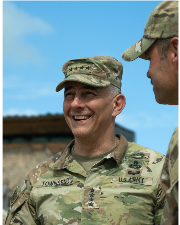
Now retired General Stephen Townsend, then commander of U.S. Africa Command, is pictured at Camp Simba in Manda Bay, Kenya, on October 27, 2021.

So, I think it's critical, absolutely critical, to maintain a U.S. military presence in Somalia, and I had this conversation with Hassan Sheikh Mohammed, during my first meeting with him, and he asked me, "How might I obtain more support from the West and from the United States?" This was several months after the start of the Ukraine war. And I told him, "Mr. President, be less like