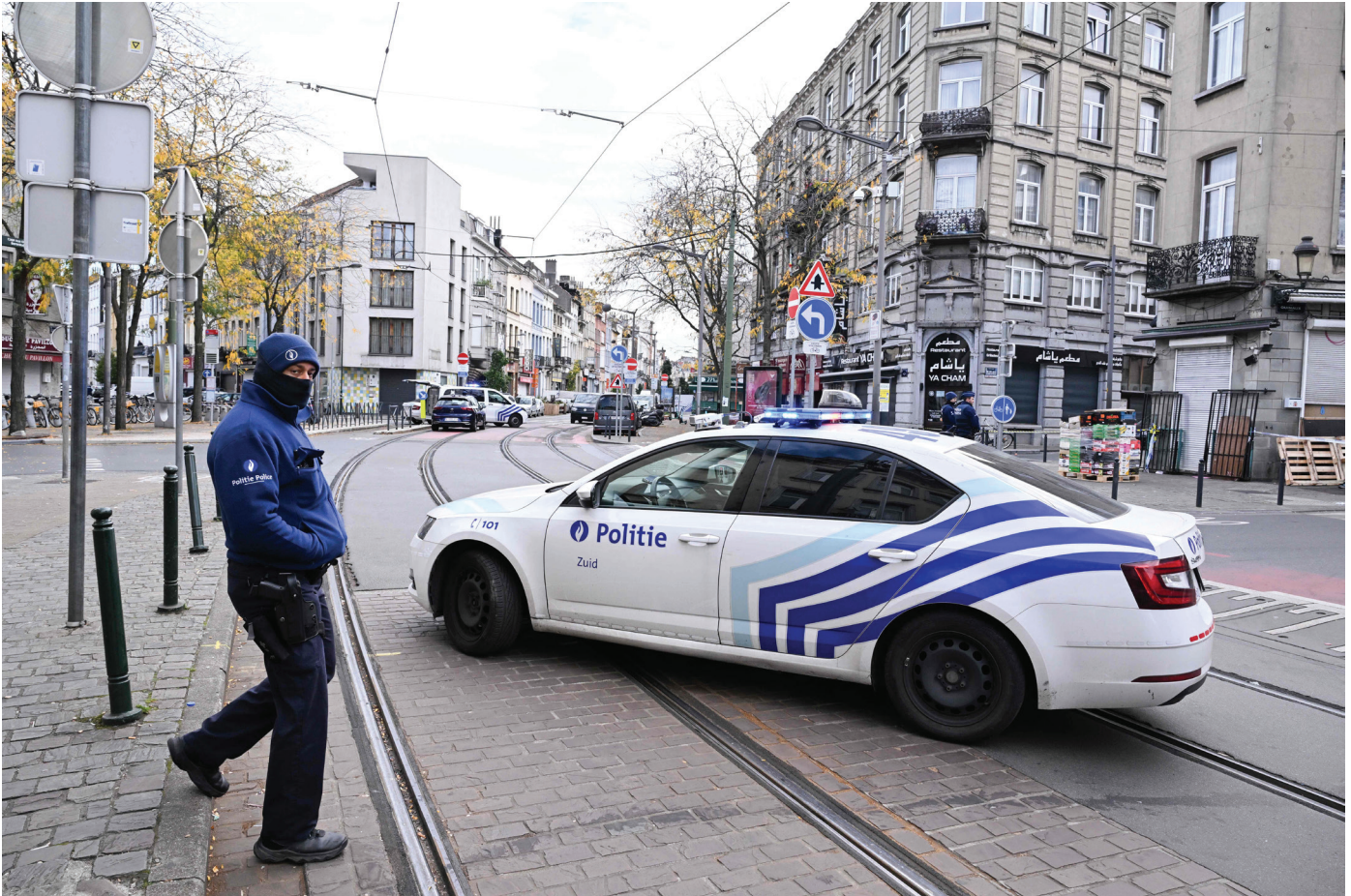
A police car is parked near the house in the Schaerbeek area of Brussels on October 17, 2023, where the suspected perpetrator of the attack in Brussels was shot dead during a police intervention.

larger Muslim populations and more porous borders,” which makes “the number of possible lone actors ... hard to track.” 16 In France, Minister of Interior Gérald Darmanin in early November reported a stark rise in anti-Semitic acts in the country with more than 480 people arrested since October 7, 17 and on November 4, a Jewish woman was stabbed in the stomach in what appears to have been an anti-Semitic attack. 18 A similar increase in anti-Semitic violence has been witnessed in the United Kingdom 19 with London’s mayor, Sadiq Khan, expressing a concern over a “rise of extremism.” 20