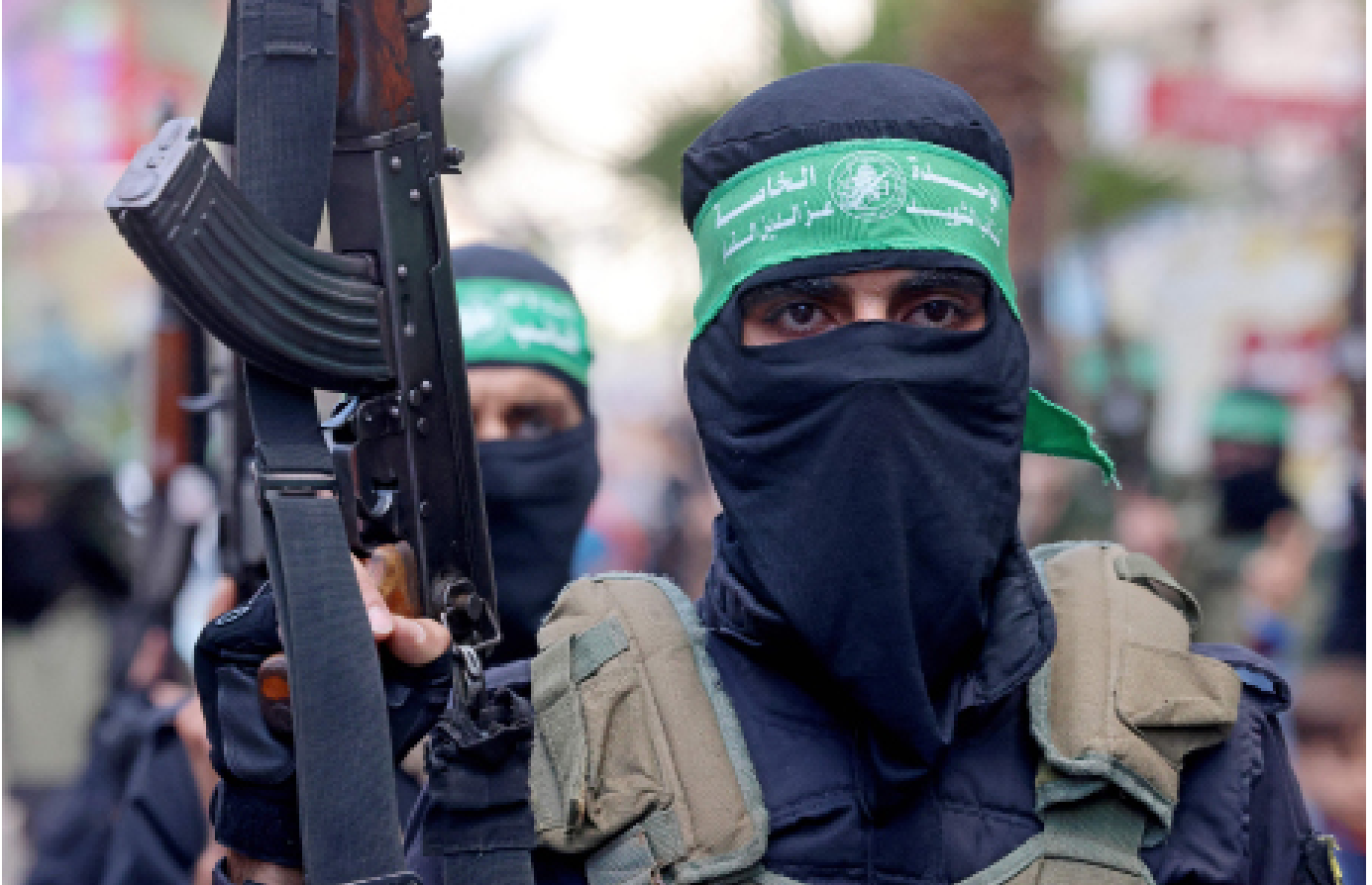
Members of Al-Qassam Brigades, the armed wing of the Palestinian Hamas movement, march in Gaza City on May 22, 2021.

With the onset of the Second Intifada in 2000, Hamas attacks dramatically increased. Between 2000 and 2005, 39.9 percent of the 135 suicide attacks carried out during the Second Intifada were executed by Hamas. 20 According to the Global Terrorism Database, Hamas killed 857 people and injured 2,819 between 1987 and 2020. 21 Intended to terrorize not only the targeted individuals but also the general Israeli population, Hamas attacks have been indiscriminate in nature. f