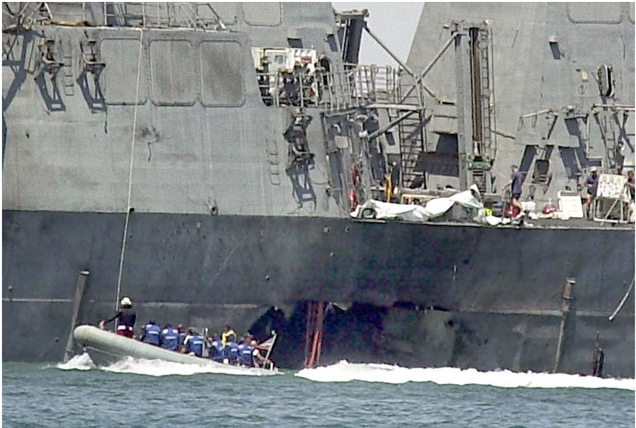
Investigators in a boat examine the hull of the USS Cole at the Yemeni port of Aden on October 15, 2000.