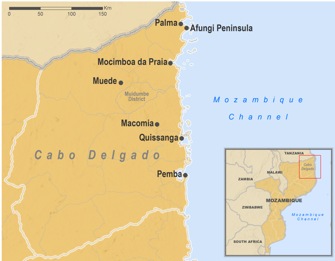
Cabo Delgado, Mozambique

Construction Services, in June 2020. 75 In August 2020, Total signed a security agreement with the Mozambique government through which the company will provide logistical support to a newly established joint taskforce that will protect its Afungi facilities and surrounding areas. 76 This suggests the company is concerned about the reach of the insurgency. But the agreement also runs the risk of diverting better elements of the Mozambican army away from the rest of Cabo Delgado.