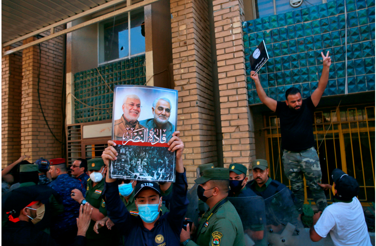
A supporter of an Iran-backed militia holds a poster of Iranian General Qassem Soleimani and deputy commander Abu Mahdi al-Muhandis during a protest by pro-Iranian militiamen and their supporters in Baghdad, Iraq, on October 17, 2020.

unaware of the nature of the movement r at the time in the chaos of the 2014 mobilization, when recruits were randomly assigned to PMF units at mobilization hubs like Taji and Samarra. 46