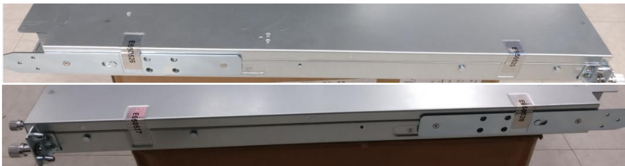
Figure 2 – Tamper Evidence Label Locations

Figure 2 identifies the locations of the four tamper evidence labels applied during the manufacturing process.