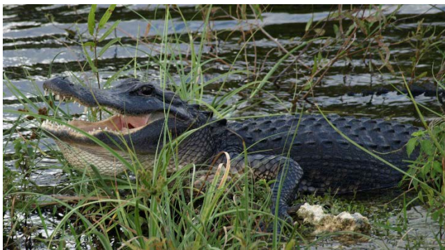
Figure 1. American alligator ( Alligator mississippiensis ) in Florida.

Recent media surrounding the release of the movie “Crawl” (2019) prompted the need for a factual risk comparison between unprovoked alligator attacks and other potentially fatal accidents in Florida. Crocodilians are often viewed as fearful predators, yet the fear of being eaten is greater than the fear of being bitten. Unprovoked bites from crocodilians happen, yet few cases involve humans as potential prey (IUCN Crocodile Specialist Group).