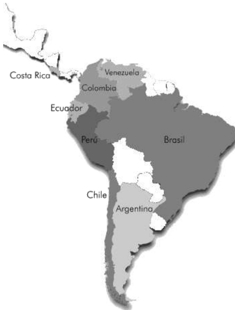
Fig. 1 Latin American countries included in ELANS