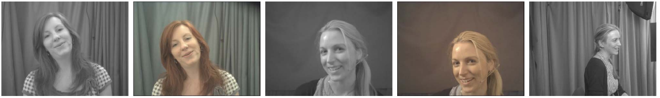
Fig. 3. Frames grabbed at a single moment in time from all five video streams. The Operator (left) has HumanID 7 and the User (right) has HumanID 14. Shown is the 3,214th frame of the 19th recording.

To record User and Operator speech, there were two microphones per person: one placed on a table in front of the User/Operator and the second worn on the head by the User/Operator. The wearable microphones were AKG HC-577-L condenser microphones, while the room microphones were AKG C1000-S microphones. This results in four audio channels. The wearable microphone was the main source for capturing the speech and other vocalizations made by the User/Operator, while the room microphones were used to model the background noise. Audio was recorded at 48 kHz and 24 bits per sample.