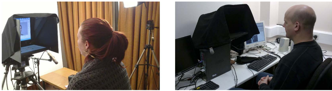
Fig. 2. Images of the recording setup for both the User (left) and the Operator (right) Rooms.

response magnitudes and latencies, and so on. These were adjusted during testing, and account for the main differences between the versions used in data collection (see below).