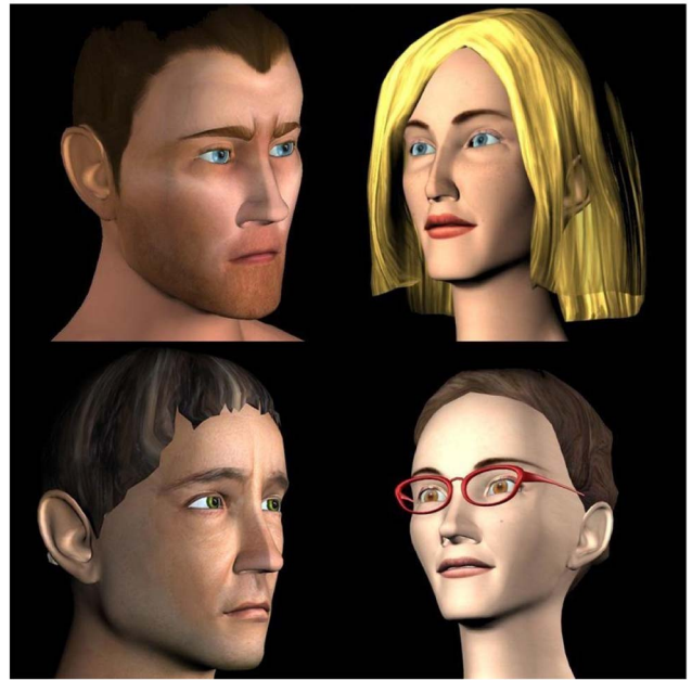
Fig. 1. The four SAL character avatars. Clockwise from top-left: Spike, Poppy, Prudence, and Obadiah.

In the first experiment, 11 Semi-automatic SAL recordings provided 44 character sessions with a procedure directly comparable to Solid SAL. Experiments 2 and 3 used degraded versions of Semi-automatic SAL in which two of the four character sessions were with the full Semi-automatic SAL system while the other two were degraded. A further 25 sessions took place (13 in Experiment 2 and 12 in Experiment 3) with differing degrees of degradation of information to the operator. The operator videos consist only of the operator interacting with the interface and show little of interest regarding the conversational interaction;