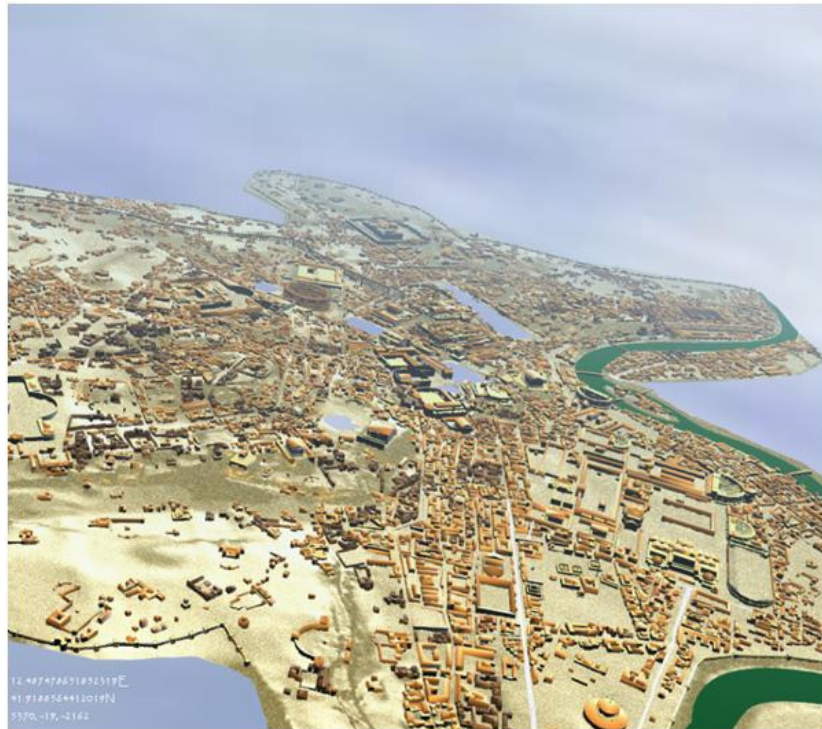
Fig. 2. Real-time rendering of the Rome Reborn model

to the GeoNames integration with Wikipedia ( http://www.geonames.org/ ) to obtain semantically-annotated data in the form of XML in response to input latitudes and longitudes. This is then processed and used as the basis for the construction of Aand minimises unnecessary web traffic generated by multiple queries with identical returns.