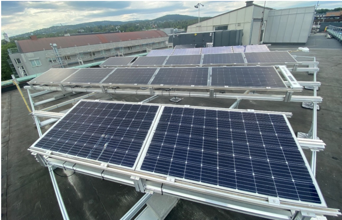
Figure 2: An image of the PV system.

inverters, and a DustIQ Soiling Monitoring System. These panels are distributed across three distinct sections on the L-shaped roof, as detailed in Table ???. The site includes installations of ten different solar panel varieties. A photograph of the demo site is provided in Figure 2. Real-time monitoring at the demo site facilitates the observation of various data, including power measurements from optimizers and inverters, as well as weather-related data. This includes power, voltage, current, radiation, dust-related parameters, wind speed, environmental temperature, panel temperature, and other relevant metrics. At the moment, the PV system can deliver up to 10 kW peak power to the grid, which can be used to charge the EV charging pile, thereby efficiently utilizing the generated solar energy.