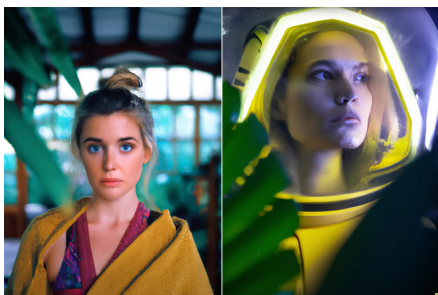
Figure 1: OpenAI Dall-E-2 photorealistic image

for prediction or classification purpose, the generative model is used to create new content. Bias in training data increases, in this case a specific ethical issue, perpetuating a potential social bias in the newly generated content.