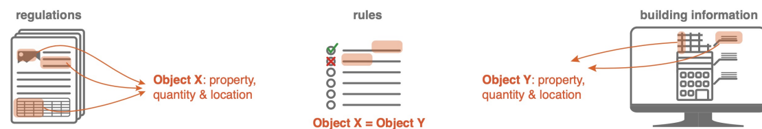
Figure 3: Parsing the regulations to a set of rules requires identifying which real-world objects are being regulated. To apply a rule, the elements of the rules have to be mapped to elements of some building or building product representation.