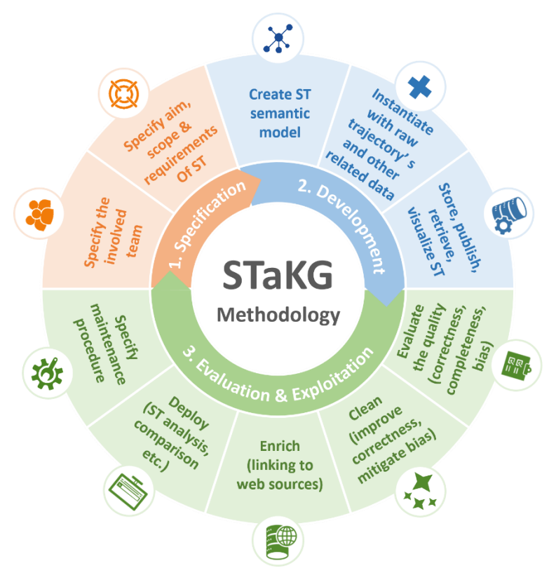
Figure 1. Phases and processes of STaKG methodology.

The three phases of the STaKG methodology are briefly described below (and depicted in Figure 1):