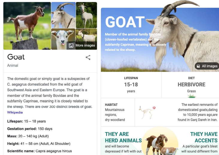
Fig. 1. The Knowledge Panel for the search keyword “Goat” in Google (left) and Bing (right). Screenshot taken on 19/03/2021

through the graph in a follow-your-nose approach. Other common features are plain text search ( /fct on Virtuoso), query helper (YASGUI 3 ), dereferencing service for linked data URI, or rich visualisation of results (like in Wikidata 4 ).