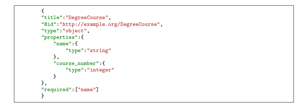
Listing 3: Schema representing the structure of DegreeCourses

Listing 2: Student schema referencing the DegreeCourse schema