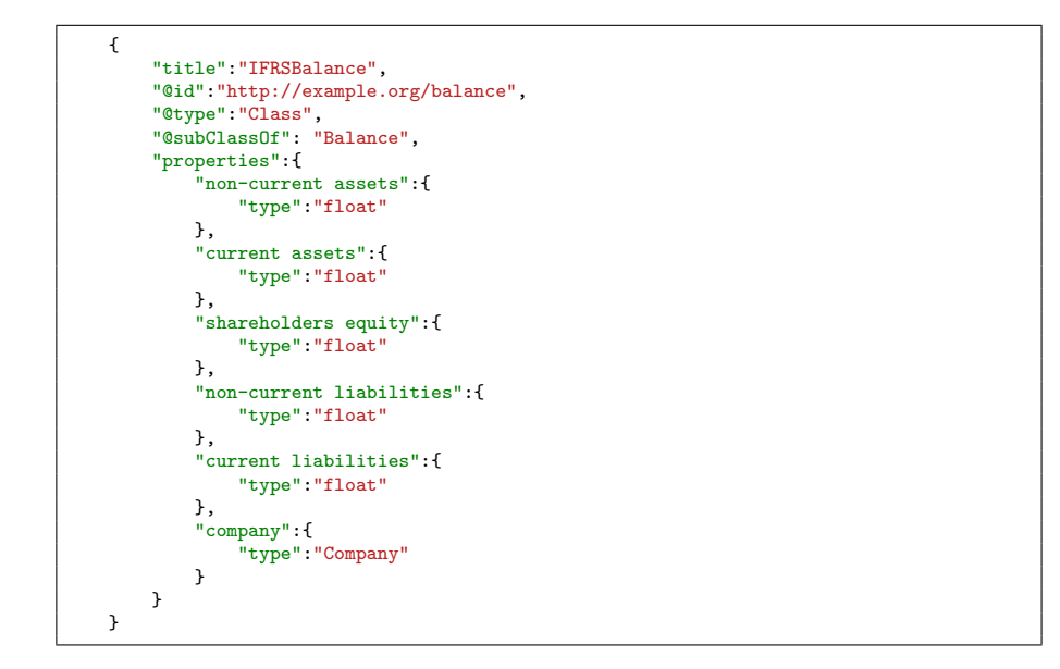
Listing 13: A JSON Schema defining the structure of an IFRS balance

Listing 14: Rule to check for a plausibility