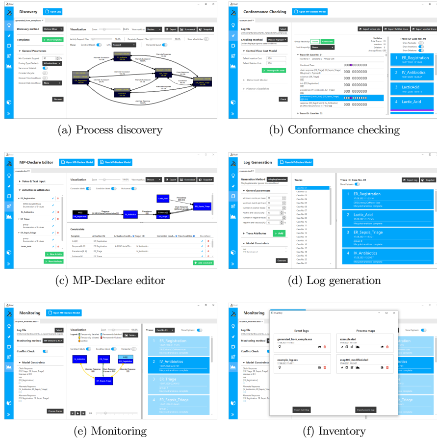
Fig. 2. Main functionalities of RuM

Conformance checking. The conformance checking functionality is based on three techniques: Declare Analyzer [6] detects activations, violations, and fulfillments; Declare Replayer [8] and Data-Aware Declare Replayer 5 report on trace alignments. As shown in Fig. 2(b), the results are presented in groups, each displaying the outcome for a specific trace or a specific constraint. For every group, its name is displayed along with general descriptive statistics. The user can freely switch among groups and toggle an extended view to read more details. In this way, users can explore the results at a high level of detail while also keeping the user interface relatively compact.