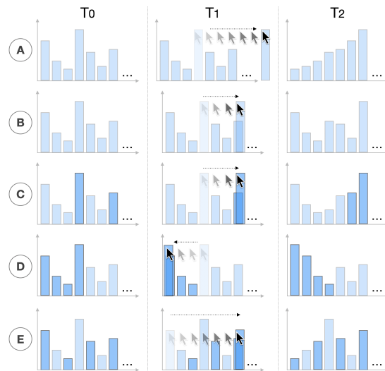
Figure 1: Direct ordering in a bar chart: ordering all items (A), changing the position of a bar (B), ordering all items in-between two selected items (C), ordering neighboring selected items (D), and ordering non-neighboring selected items (E).

Direct ordering allows applying it to a selection in the same way as that to an entire bar chart. Figure 1 (C, D, and E) shows how direct ordering works on a selection