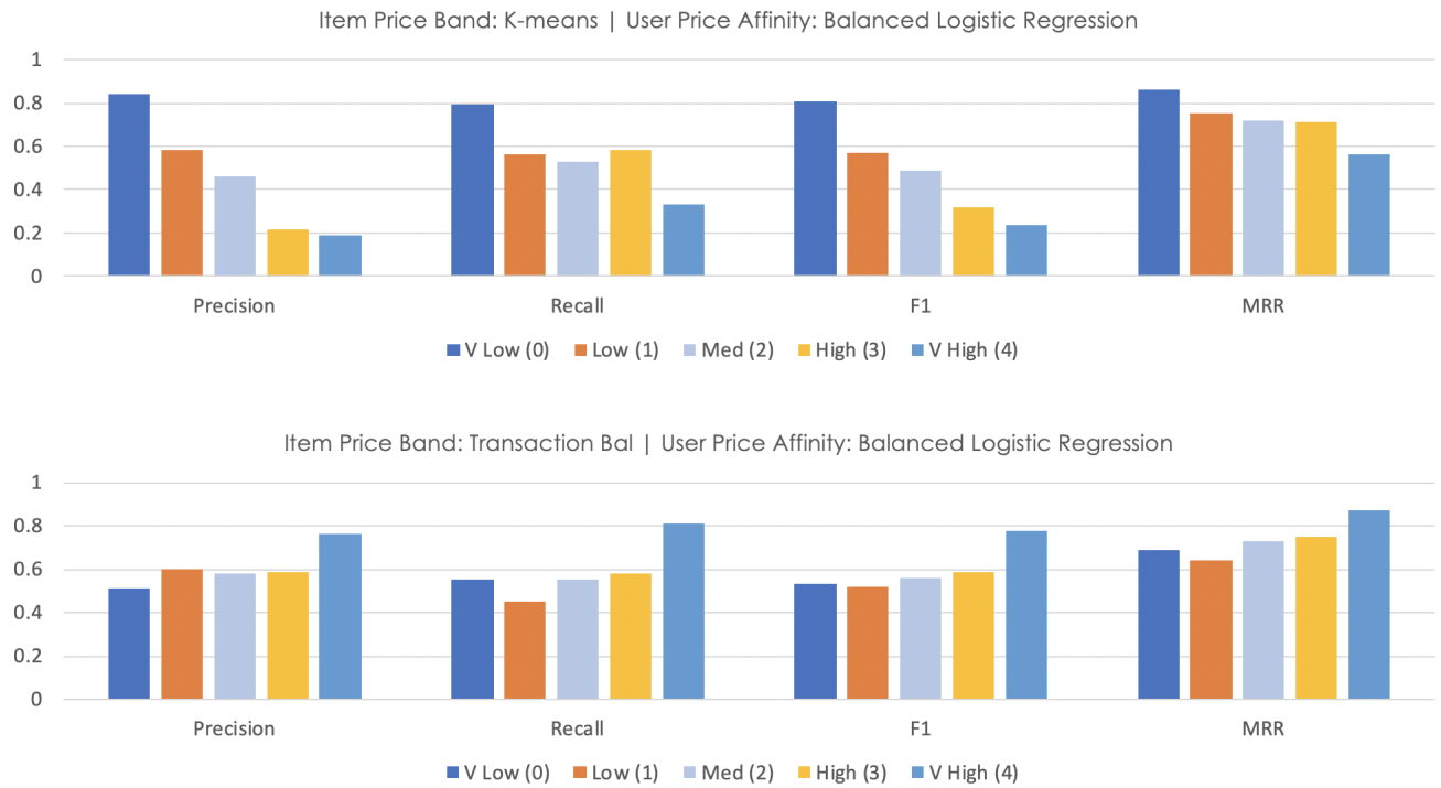
Figure 3: Comparison of Evaluation Metrics for Balanced Logistic Regression with k-means vs transac-bal item price banding