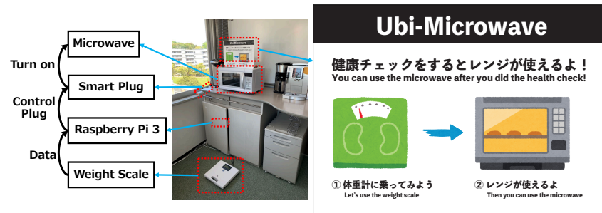
Fig. 2. Prototype of proposed design

a raspberry Pi 3 (in the storage), a weight scale, and a microwave. People who care about their health condition often take medical checkups, but those who are not interested may not even stand on a weight scale. This prototype is taking advantage of the timing and demand that users need to use the microwave to heat their foods, trying to change users' attitudes to their health condition by promoting users to use the weight scale and letting them be aware of their health condition. To improve the motivation, the user who has weighed him/herself can use the microwave as a reward. Since these smart devices are related to users' daily habits, we believe that it can improve users' motivation and effectively induce behavior changes.