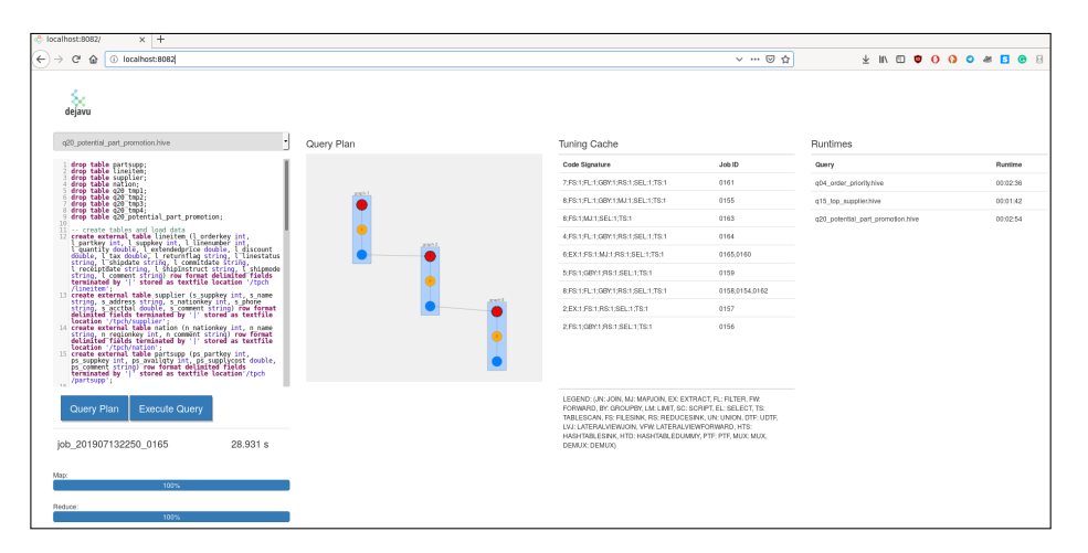
Fig. 3: The interactive DejaVu demo shows TPC-H queries, their query plans compiled by Hive, and the code signature cache getting populated, as TPC-H queries are compiled and profiled over time.

Acknowledgments We thank Herodotos Herodotou for all the support with Starfish. This study was financed in part by the Coordenação de Aperfeiçoamento de Pessoal de Nível Superior - Brasil (CAPES) - Finance Code 001.