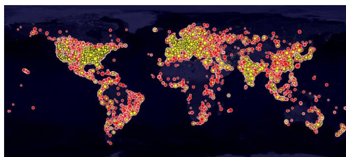
Figure 1: Global users of HUBzero-based science gateways

The last decade has led to diverse, mature, science-gateway frameworks such as HUBzero [12], the Agave Platform [13], Apache Airavata [14], and Galaxy [15]. Their worldwide usage is an example for the potential of sharing science gateways