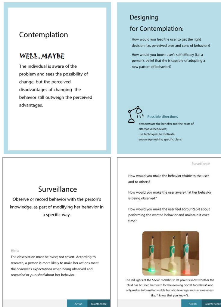
Fig. 2. Two sides of a Stage card (Top), Two sides of a Technique Card (Bottom)

Through an empirical study, we aim at evaluating the impact of the tool on designers' creativity, their capacity to create theoretically-grounded designs, as well as the perceived usefulness and ease of use of the BCD cards as a supporting tool in the design of behavior change technologies.