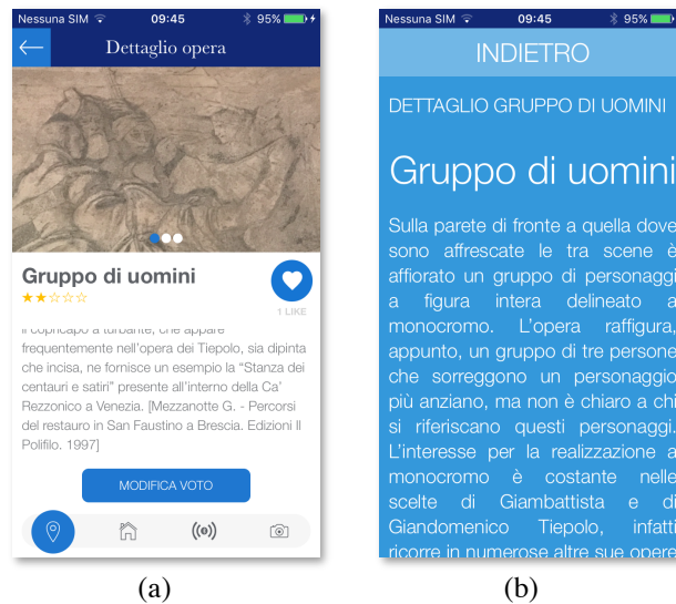
Fig 1. Child' view of artwork description (a) vs 'blind' view suitable to screen readers (b).

Accessibility of contents are managed through the user profile. In particular, on first access to the app, the visitor may declare to be a child, a tourist or a scholar, and the app will select automatically the contents that are most suitable to that type of user. For instance, children may enjoy a description suitable to their reading skills and have the possibility to vote the artworks they like (Fig. 1(a)).