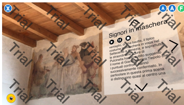
Fig. 2. AR screen of UniBSArt4All app.

The app also allows tailoring content and interaction according to the possible disabilities of the user. In particular, in the user profile, one may declare a hearing or visual impairment, thus allowing the app to adapt its interaction possibilities. For instance, in the case of visual impairment, the app provides voice-over features and organizes the pages in a way suitable to screen readers and selections made by visually impaired users (Fig. 1(b)). In this case, beacons are used to detect the closest artwork and tell the user all related contents. If more than one artwork is detected, a simplified pop-up, suitable to visually impaired users, is shown (and told) to allow artwork selection. In case the user declares to have a hearing impairment, suitable videos are proposed, including subtitles or descriptions through sign language.