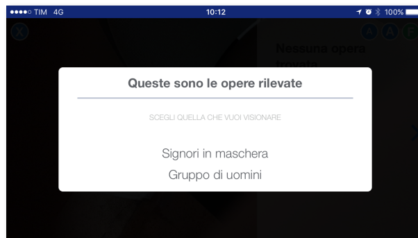
Fig. 3. Automatic detection of artworks through BLE technology.

Museum curators may use a web-based EUD tool to manage the structure and contents of the app (Fig. 4). In this way, it allows an easy adaptation of the project to any type of museum. This tool allows curators to create the museum floors and their related rooms, as well as all data associated to the artwork objects available in the museum, with the specific contents related to the different user profiles. Moreover, they may easily assign beacons and photos to artwork IDs for easy retrieval at run time. Through the EUD tool, the curators can also manage user accesses and monitor visit trends.