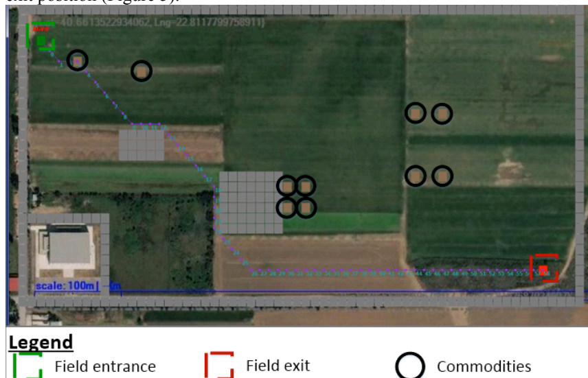
Fig. 5. Simulation.

A common scenario is examined in the present paper as exemplar demonstrator. An in-field transfer of goods is simulated. The load is allocated to specific cells at the active field area and makes a transfer request to the AGV. The AGV begins from the starting position and finds an optimum pathway using the A* algorithm for reaching the user-specified goods. The AGV loads the goods and then transfers them to the exit position (Figure 5).