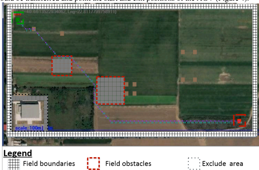
Fig. 4. The user defines the agricultural field's characteristics.

Following that, the user provides feedback and interoperates with the system by marking grid cells in the tool's embedded layer applied on top of the retrieved agricultural field's image. The selected grid cells indicate the field's boundaries, mark the position of any obstacles in the field, specify exact location of goods that should be transferred and point the start and exit positions of the AGV (Figure 4).