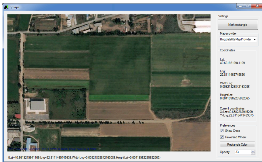
Fig. 2. The user locates the region of interest using the Google Maps Service.

Firstly, the provider's map is embedded to the developed simulation tool to implement an absolute position oriented guidance system. It is worth mentioning that the GMap.NET acts a middleware in order to promote maps from different providers to windows applications. It enables the use of routing, geocoding, map directions and map previews to developers. As a next step the GMapControl tool was incorporated to the Toolbox for providing a handler to the MainForm of the application which links the form to the map's service provider using the proper libraries. Inside the form the GMap's menu is implemented in order to handle the maps properties and the user can select the presentation details of the map. Furthermore the selection "Mark Rectangle" provides an event handler for the creation of a dedicated form that embeds the region of interest and metadata information to the application. The region's coordinates and the map's scale are considered critical for the software tool. The user manually locates the region of interest (Figure 2).