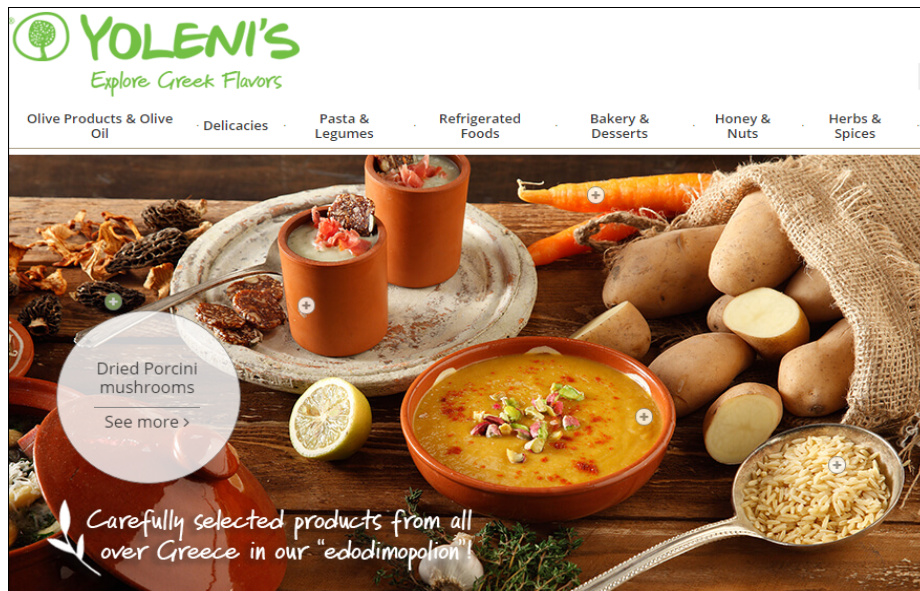
Fig. 2. Yoleni's – Greek products