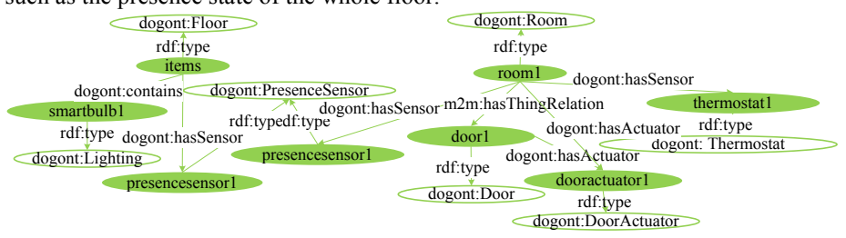
Fig. 3. Output RDF graph

Fig. 3 presents the simplified output graph of semantic annotator, while a detailed graph is presented in [12]. The ontologies used are OneM2M ontology [8] and DogOnt [19]. Through SPARQL endpoints, we are able to get additional information such as the presence state of the whole floor.