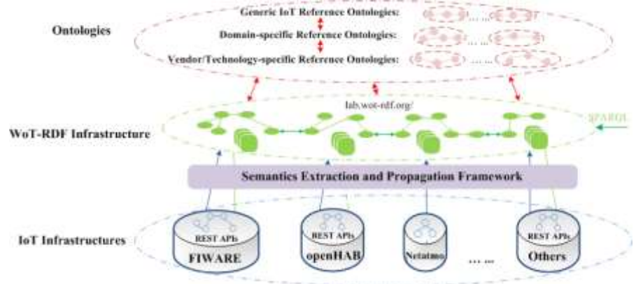
Fig. 4. Cross-fertilizing IoT data with JSON-LD

Fig. 4 summarizes the idea of cross-fertilizing IoT data based on our propositions. Semantics extraction and propagation framework connects WoT-RDF infrastructure and IoT infrastructures by constructing RDF graphs from IoT REST interfaces and generating JSON-LD descriptions based on our data model. WoT-RDF infrastructure provides two views for the linked IoT data: general RDF graphs for SPARQL query, and JSON-LD documents to connect IoT infrastructures. Three parts of ontologies respectively provides semantics in three abstraction levels.