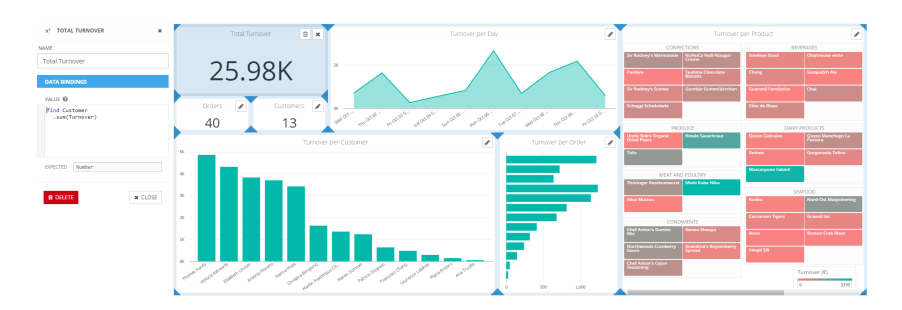
Fig. 2. An exemplary dashboard consisting of different configurable visualizations.

be used by the prototype to enrich the aforementioned information flow graph and to generate the SIFG. Therefore, the prototype represents a full implementation of the conceptual model as presented in Section 2.