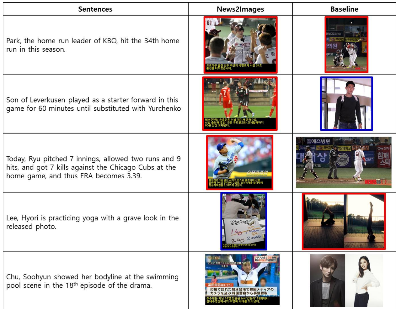
Figure 3. Examples of image-based contents generated from the summarization sentences extracted from news articles by News2Images and the baseline method. Images with a red border are very similar to the sentences. Blue bordered images include the persons referred in the given sentences but represent contents different from the sentences.

Figure 3 illustrates good and bad examples of image-based contents from news articles. Most of the images are related to the