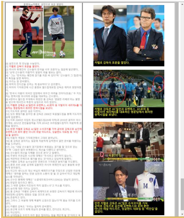
Figure 1. An example of the image-based contents generated from a news document by News2Images. Left box includes an original online news document and right box represents the contents summarizing the news into three images. Red sentences in the left box are key sentences extracted by summarization and they are located in the black rectangle below the retrieved images in the right box.

key sentences, we define a score considering both the similarity to the core news contents and the diversity for the coverage on the entire contents of the news. The similarity and the diversity are computed using sentence embedding based on word2vec [10]. The image retrieval module searches the images semantically associated with the sentences extracted by the summarization module. The semantic association between a sentence and an image is defined as the cosine similarity between the sentence and the title of the news article which the image is attached in. Also, we use the hidden node values of the top fully connected layer of the convolutional neural networks (CNNs) [4] for each image as an image feature. Finally, the image-based content module generates a set of new images by synthesizing a retrieved image and the sentence corresponding to the image. These image-based contents generated can improve the readability and enhance the interests of mobile device users, compared to text-based news articles. The proposed News2Images has the originality in aspect of generating new contents suitable for mobile services by summarizing a long news document into not sentences but images even if there exist many methods for summarization [9] or text-to-image retrieval [1]. Figure 1 presents an example of the image-based content consisting of three synthesized images generated from a Korean online news article.